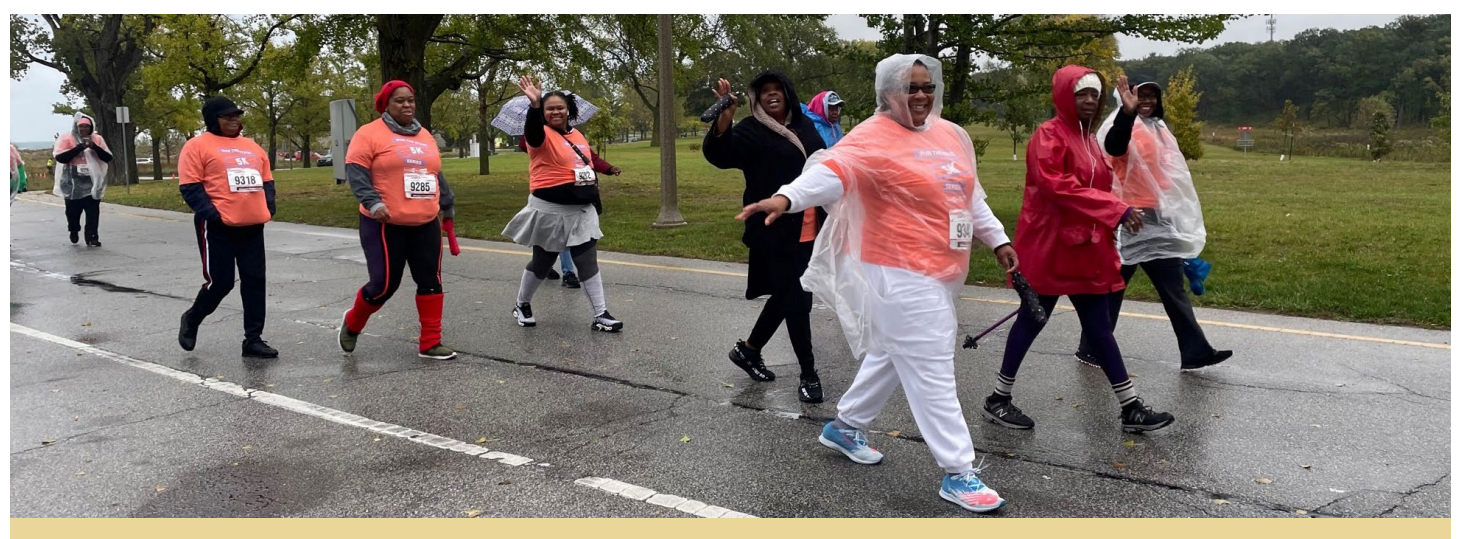
State employees waving at the camera during the Gary 5K.

Stay tuned to investinyourhealthindiana.com for updates on future health & wellness initiatives!