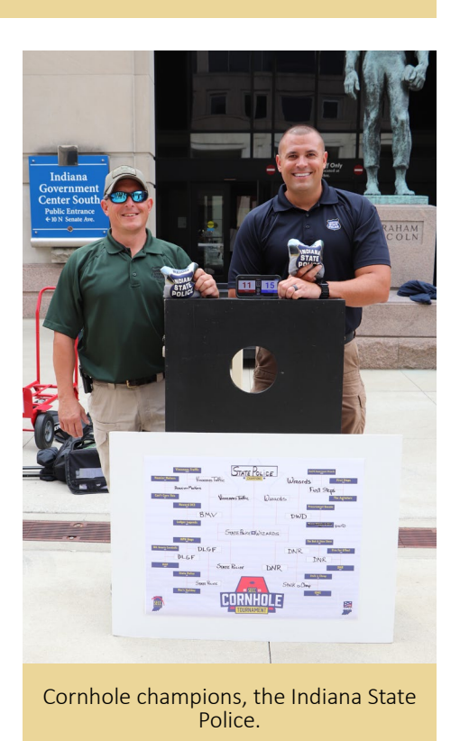
ultimately, the State Police team was victorious. All proceeds from the event were donated to the Indiana Department of Homeland Security's 501(c)(3) charity of choice for SECC, Hoosier Burn Camp.

The Health Department Wizards beat out DNR to make it into the top two and State Police defeated Vincennes Traffic for the final spot. The two teams battled it out in the championship round and