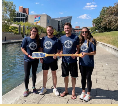
Left: Five teams battle it out in one of the first round heats. Right: The Paddle Battle winners, the Number Ninjas from State Board of Accounts.