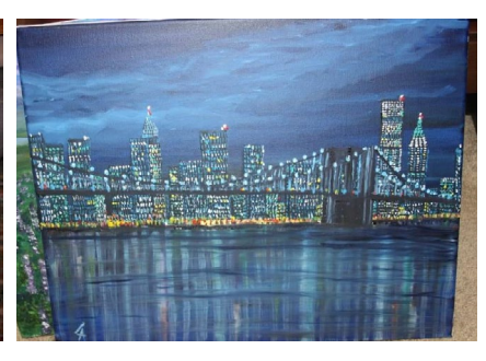
Artwork by Craig Allman (Department of Transportation)