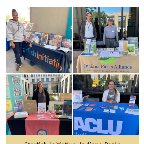
Starfish Initiative, Indiana Parks Alliance, Indiana Diaper Bank and ACLU of Indiana are just a few of the organizations in attendance.

We had over 30 charities at our first annual charity fair where state employees were able to learn about different organizations and the great work they do. We also raised over $700 from our Statehouse Market vendors and food trucks. Those proceeds were split among the featured SECC charities (Hoosier Burn Camp, Gleaners Food Bank, Mighty Mason Fund, HVAF of Indiana and CPAFI).