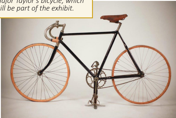
Major Taylor’s bicycle, which will be part of the exhibit.