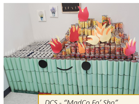
DCS - “MadCo Fo’ Sho” collected 2,653 cans for their 2022 Dumpster Fire