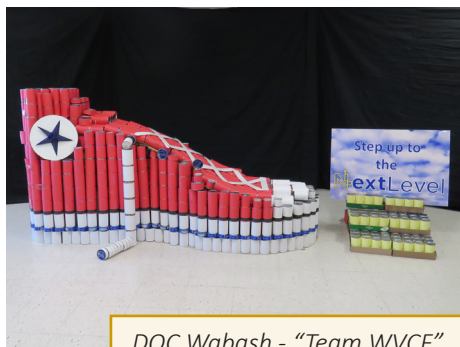
DOC Wabash - “Team WVCF” collected 1,626 cans for their Converse High Top