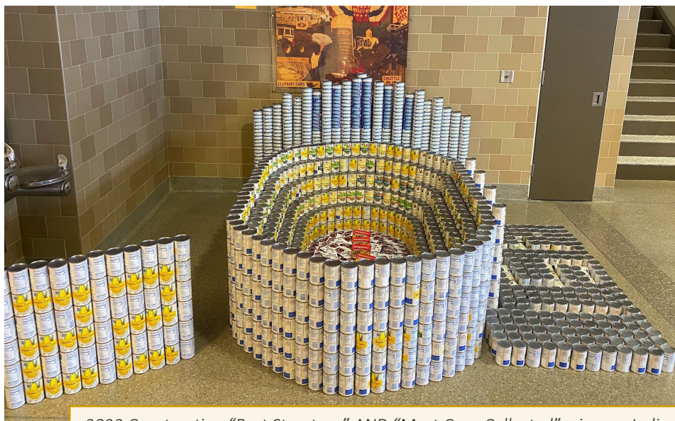
2022 Canstruction “Best Structure” AND “Most Cans Collected” winner - Indiana State Fair Commission, collecting 2,864 cans for their re-Canstruction of the Indiana Farmers Coliseum!

Article Submitted by Kaitlyn Wampler - INSPD Communications