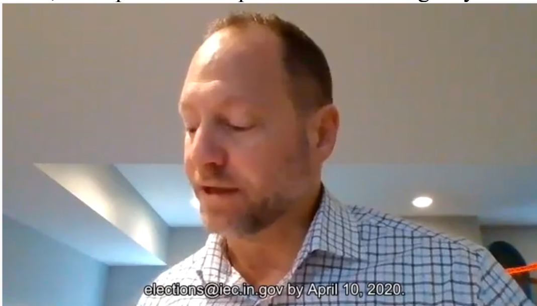
March 25, 2020 Indiana Election Commission Meeting

I am one of the 11 viewers of the Election Commission's April 7 video of the March 25 meeting in which the commission unanimously passed the order to move the Primary Election to June 2, among other miscellaneous items, in response to the public health emergency.