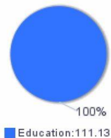
Table 1: MSYs by Focus Areas