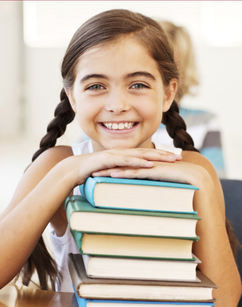
Table of Contents (continued)