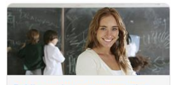
Public employee compensation