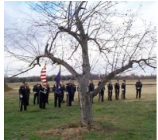
The Indiana Veterans' Memorial Cemetery

State long-term care surveys of the IVH in 1999 and 2000 produced no finding of deficiency in care. Only five percent of all nursing homes meet this standard, indicating the quality of care being provided to Hoosier veterans. No state survey or VA inspection has identified any serious care-related finding since 1994. Resident and family surveys, conducted by an external organization in 1999, reflected a very high rate of customer satisfaction