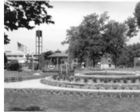
The Indiana Veteran's Home

The IVH provides comprehensive and skilled nursing care for 264 residents with high acuity levels, major disabilities, and multiple chronic conditions associated with the aging process. It provides assisted living care for 55 residents who require 24-hour observation and medication administration, but do not require around-the-clock licensed nursing care. IVH also provides self-care rooms for 38 residents who can care for themselves but have conditions or disabilities that negate normal employment, or have serious financial situations.