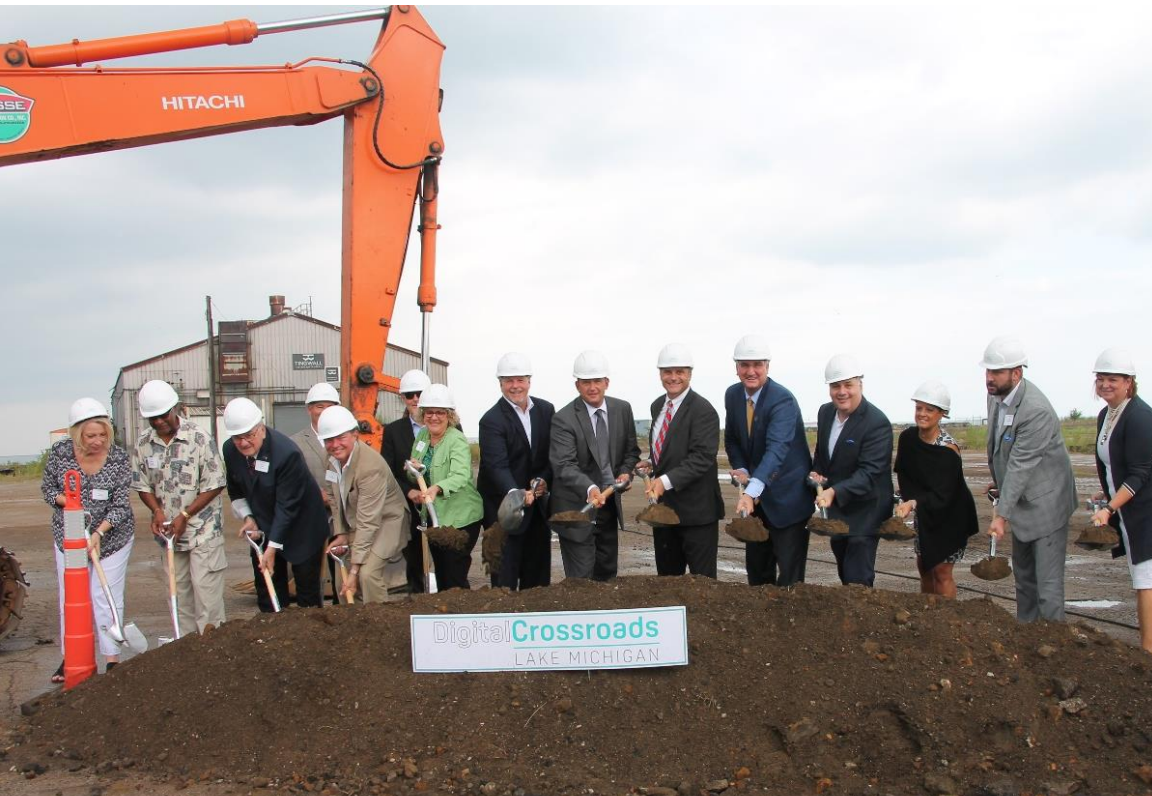
DIGITAL CROSSROADS OF AMERICA DATA CENTER // Hammond Data center, tech incubator, greenhouse & public spaces with access to lakefront

Making Indiana a Magnet for Jobs & Hub for Innovation