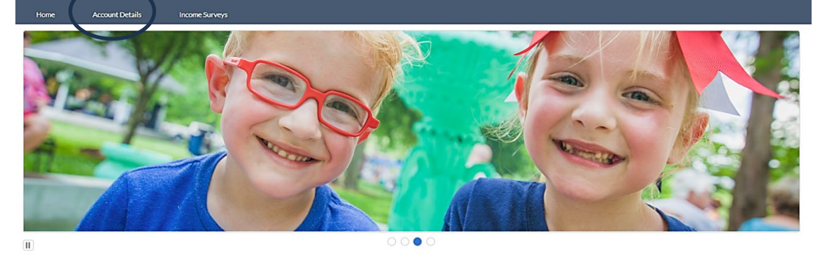
Welcome to Indiana Grants Management!

4) On the next page, on the menu's upper left side, select Grant Administration and the correct Grant ID for the program income report.