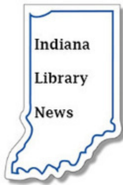
Exhibit Columbus and partners to host Next Generation Day Bartholomew County Public Library

Unleashing Crown Point's history: city showcases new statue, historical tour Crown Point Community Library