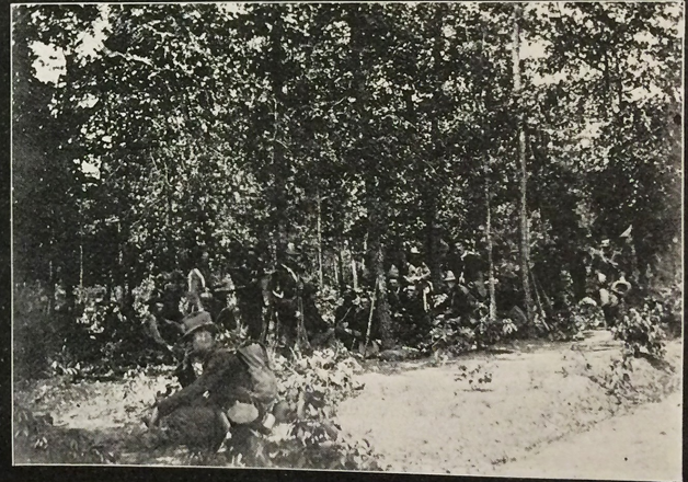
THE ONE-HUNDRED-FIFTY-SEVENTH INDIANA LEAVING CHICKAMAUGA FOR TAMPA.