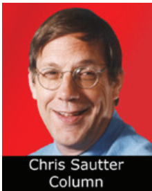
Chris Sautter Column

Coats must avoid mistakes. Coats stumbled coming out of the gate. He seemed unprepared to run and