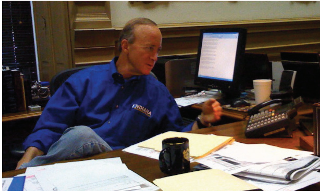
Gov. Mitch Daniels talked to Howey Politics Indiana in his Statehouse office on Thursday. He plans to aggressively work for Republican House candidates.

Daniels is engaged and strategizing about retaking the Indiana House. It was a luxury he had during the first two years of his gubernatorial tenure and he has Major Moves, the inspector general, a balanced budget, a successful tax amnesty program and telecommunications reform to show for it. Ultimately the history of this governorship and the education and local government reform pillars that will be the thrust of the legacy he doesn’t dwell on rests with a Republican House for the final two years of