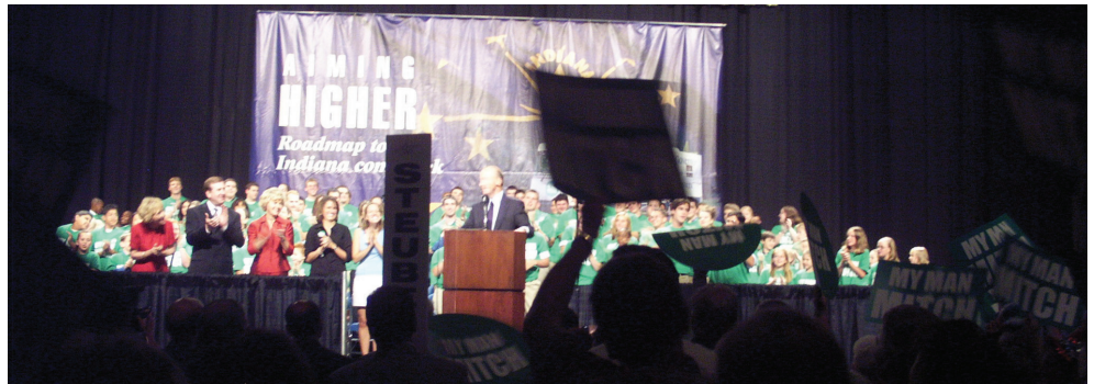
Gov. Daniels' first "Aiming Higher" campaign in 2004 brought along a Republican Indiana House. His Aiming Higher PAC intends for a reprise this November.

The governor finds a tailwind blowing when it comes to the House. Gov. Daniels' Aiming Higher PAC has