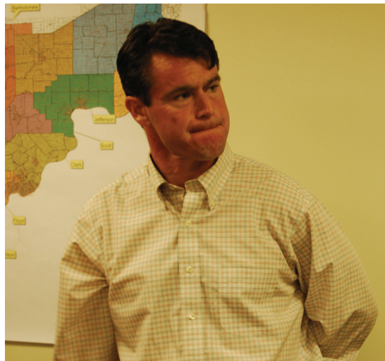
Todd Young grimaces during a long Election Night that turned into a three-way battle with Mike Sodrel and Travis Hankins.

Hill vowed to put up a fight. "I have a record of tackling critical issues like energy independence, health care and fiscal responsibility. And, I want to continue serving as an independent voice for the people of Indiana's Ninth Congressional District, fighting for more and better jobs for hard-working Hoosiers, enhanced fiscal reform, a clean-energy jobs package that will create homegrown jobs while significantly strengthening our national and economic security, and ensuring our troops and veterans have the benefits they need and deserve." ❖