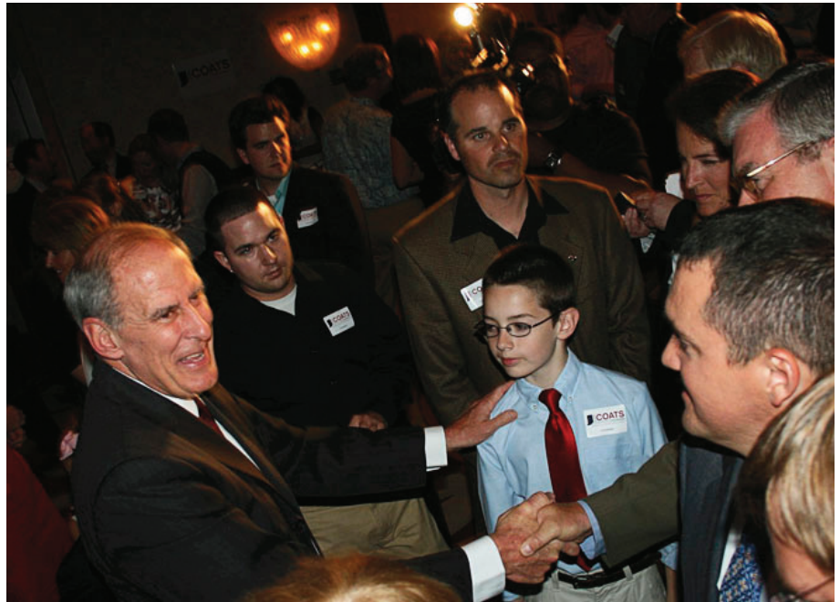
Dan Coats is congratulated after his 10 percent win with 39 percent of the vote on Tuesday.