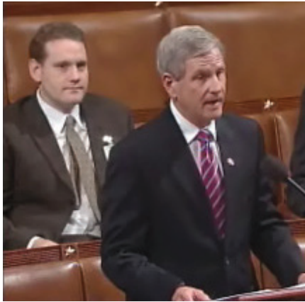
U.S. Rep. Baron Hill on the House floor.

Even though Hill is a leader of the conservative Blue Dog Democrats, the group has yet to form a solid bloc or articulate principles to which each member adheres. They go off in various directions on issues like health care reform. Hill stepped up and voted for health care in part because he is strengthening his ties to House leadership and the White House. White House chief of staff Rahm Emanuel is scheduled to appear at an upcoming Hill fundraiser. The risk for Hill is that votes that please Emanuel may not look so good to Hoosier voters in the 2012 gubernatorial primary.