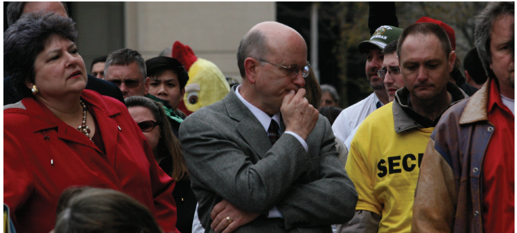
The Tea Party movement is the wild card in Indiana politics in 2010. Here is a scene from the April 15, 2009 Statehouse Tea Party.

HPI spent a good part of this week looking for