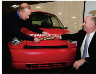
Gov. Daniels helped celebrate the arrival of the Think car to Elkhart on Monday.

2. U.S. Rep. Mike Pence: Achieving the third-ranking position among House Republicans has substantially boosted Pence's political profile. Although he has a strong platform from which to critique Democratic leadership, he and his fellow Republicans rarely influence the direction of the House thanks to rules that give the majority almost absolute authority over the legislative agenda. But Republicans are cohesive. When they hang together, they have a chance to lure enough moderate Democrats to their side to make votes