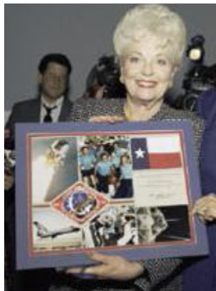
Texas Gov. Ann Richards