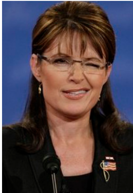
Gov. Sarah Palin during her debate with Sen. Joe Biden.

And then there was this little gem in Cedar Rapids: In answering a question, the second -banana-to-be re-sponded, "That's exactly what we're going to do in a Palin