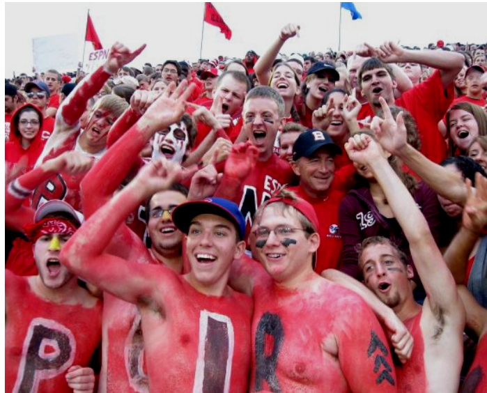
Gov. Daniels with Ball State students at a recent football game.