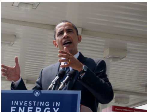
Sen. Barack Obama at an Indianapolis Phillips66 station in April.