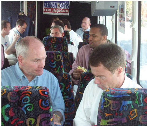
Gov. Joe Kernan's 2004 campaign relied on Site Selection Magazine to show its economic development prowess.