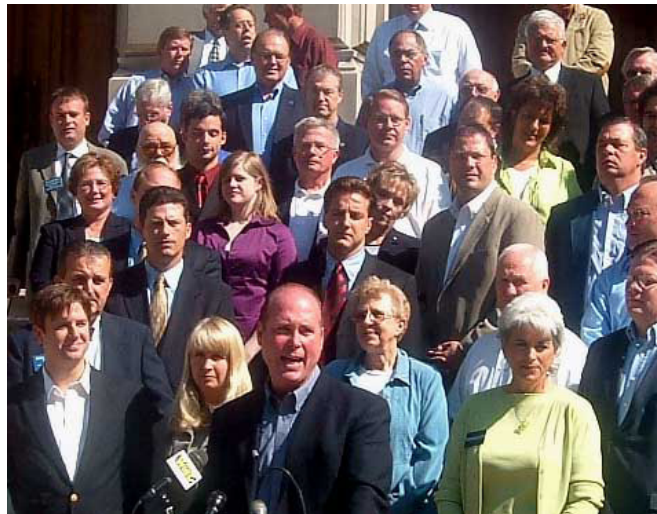
House Republicans gather in 2006 to make the first in a series of campaign promises, but backlash to the Iraq War and Capitol Hill ethic lapses doomed the majority they hope to reacquire this fall.