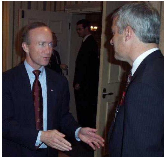
Former congressman David McIntosh chats with Gov. Mitch Daniels in February 2003 at Lebanon. At the time, McIntosh was seeking his second GOP gubernatorial nomination and Daniels was White House budget director and pondering a return home.