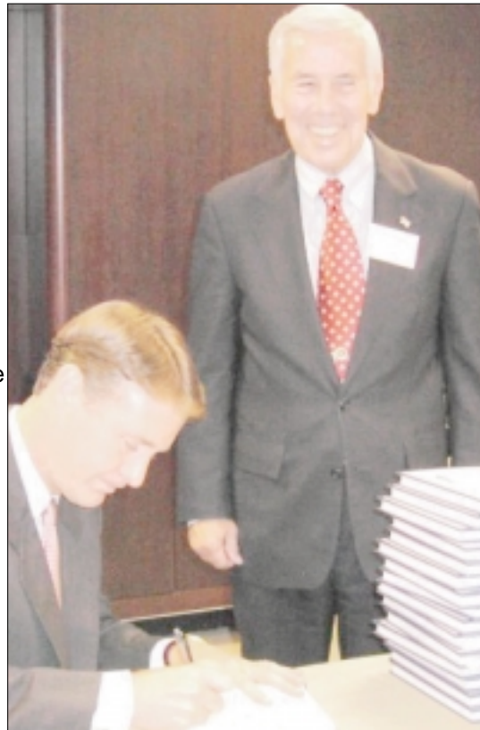
Sens. Bayh (left) and Lugar have taken the lead on energy independence.