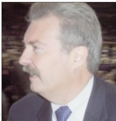
U.S. Rep. Mike Sodrel

Now, if you're a Republican, the good news is that it's early. Way early. There is plenty of time for things to turn around.