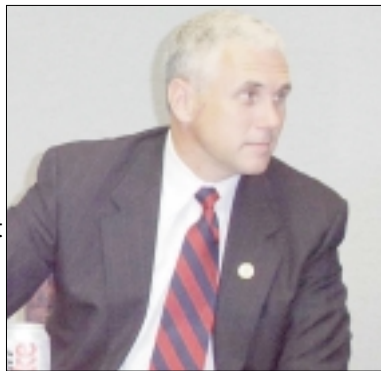
U.S. Rep. Mike Pence

But Pence and other opponents of embryonic research doubt its efficacy and oppose spending federal dollars. "To date, embryonic stem cell research has not produced a single medical treatment, where ethical adult cell research has produced some 67 miracles," he said last week in a statement on the House floor. "I believe it is morally wrong to take the tax dollars of millions of pro-life Americans, who believe that human life is sacred, and use it to fund the destruction of human embryos for research." Embryonic stem cell research can still proceed with state or private funding. California is investing $3 billion in stem cell research.