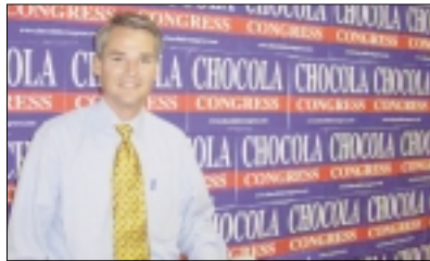
U.S. Rep. Chris Chocola