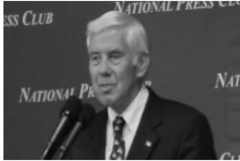
Sen. Lugar speaks at the National Press Club on Wednesday.

session after his speech, Lugar became animated in illustrating how devastating the Sept. 11, 2001, terrorists attacks would have been if the planes that plowed into the World Trade Center, the Pentagon, and a Pennsylvania field had nuclear weapons on board. "We would all have been annihilated," Lugar said, his voice rising. "That has to begin to sink in."