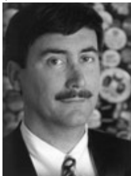
Dr. Larry Sabato

Sabato is writing two books on the 2004 presidential campaign and will offer insights into the presidential race during the Forum's first panel as well as during the luncheon keynote address. "Politics is a good thing!" is Sabato's slogan. As founder and director of the University of Virginia's Center for Politics, Dr. Sabato bridges the gap between the ivory tower and the real world on issues of critical importance to American democracy and the challenges facing our political process. His comments frequently appear on the major networks and in the nation's top newspapers.