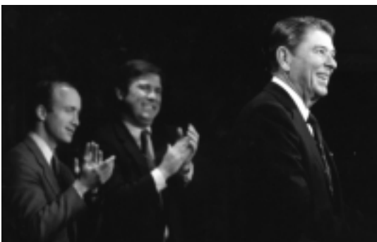
Daniels (left) with President Reagan