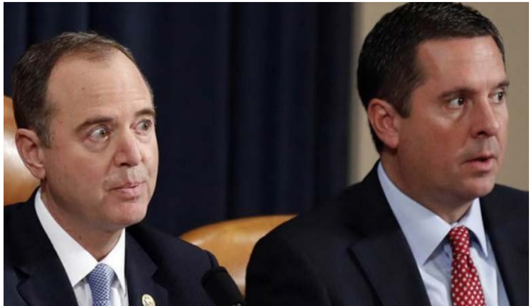
House Judiciary Chairman Adam Schiff (left) and ranking Republican Devin Nunes at Wednesday’s opening impeachment hearing on President Trump.

Republicans from Trump himself to his allies on Capitol Hill called the probe a “witch hunt” designed to overturn the 2016 presidential election. “Today, America