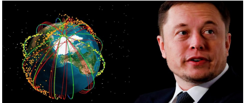
Tesla's Elon Musk and his SpaceX Starlink concept.

Others point to Tesla CEO Elon Musk's SpaceX company, which launched two satellites on the Falcon