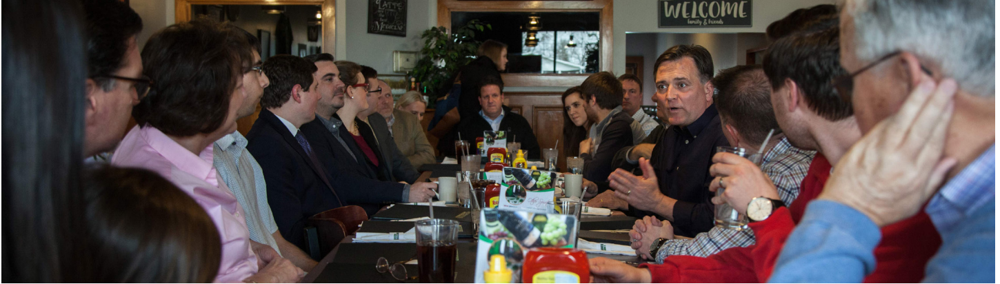
Luke Messer responds to questions at the Westfield Diner on Monday.

going to lead to a growing economy and more jobs and we'll see increased dollars in government coffers from having taxpayers with larger paychecks contributing to the broader economy. The only time we've actually balanced budgets and gotten rid of the deficits in modern times was in the 1990s when we had a growing economy. It was growing at a far faster rate than it did during the Obama years. Secondly, the national debt doubled under the Obama presidency. Joe Donnelly voted for all those budgets and spending bills. So, to now say he won't vote for the budgets or tax cuts because it somehow contributes to the deficits, then why did he vote for all those Obama spending bills that had far more dramatic impacts than this tax bill will?