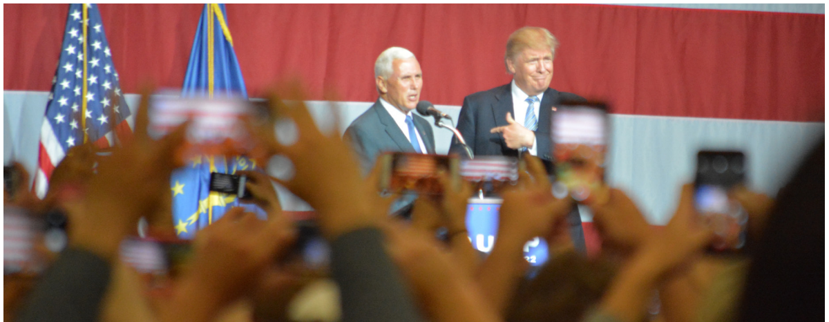
Donald Trump points to Indiana Gov. Mike Pence during his "audition" for the ticket in Westfield in early July, 2016.