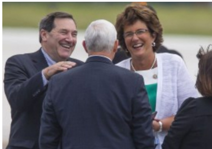
U.S. Sen. Joe Donnelly and U.S. Rep. Jackie Walorski greet Vice President Pence in May prior to his address to the University of Notre Dame graduation.