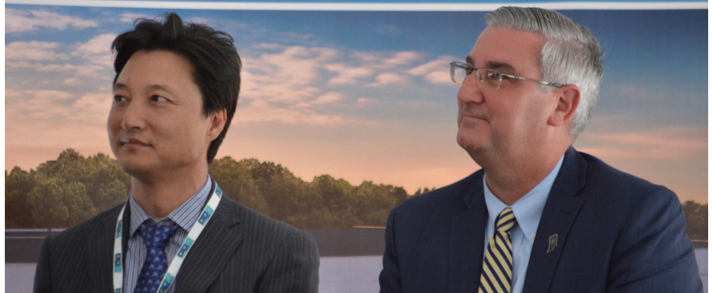
Gov. Eric Holcomb welcomed Chinese company BNI Group to Greenfield in July.