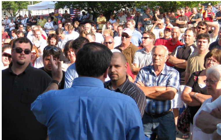
Then U.S. Rep. Joe Donnelly during an angry town hall meeting on a sweltering August 2009 day in Kokomo.