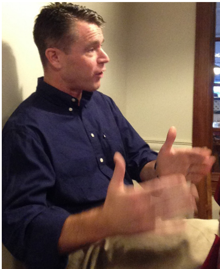
Senator-elect Todd Young talks with the press Wednesday morning at LePeep downtown to discuss the election and his coming policy agenda.

"It's also amazing what doesn't get done in a lame-duck session," Young said. "It's a really unpredictable dynamic time." ❖