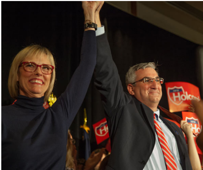
Lt. Gov. Eric Holcomb and runningmate Suzanne Crouch celebrate their victory at the JW Marriott Tuesday night.

A POS polling memo issued on Wednesday observed, "Even with modeling for a presidential turnout that followed the patterns of '08 and '12, yesterday's votes and the exit polling indicate that the enthusiasm gap between Trump and Clinton had traction. Simply put, Clinton did not perform like Obama and was unable to pull Democratic coalitional groups to the polls. It appears that the Democratic campaigns modeled for turnout levels similar to '08 and '12, but when those groups didn't materialize, they were essentially stuck, losing key battleground states due to low Democratic core group turnout."