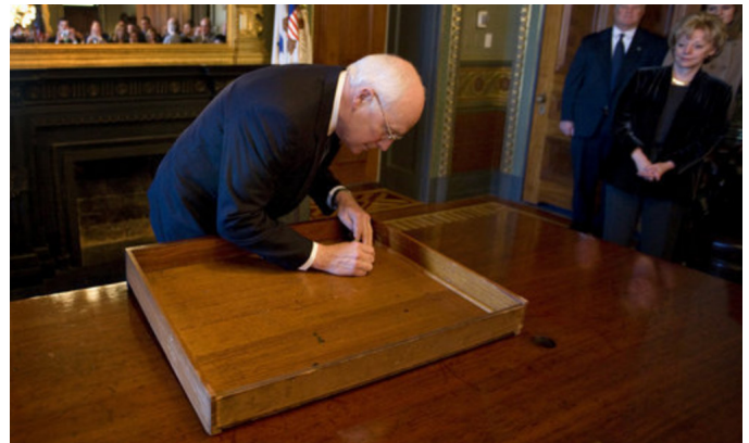
Vice President Dick Cheney signs the Teddy Roosevelt desk drawer in January 2009.

the path to political extinction in 2016. The Religious Freedom Restoration Act debacle essentially ended a conceived presidential campaign that would have thrust him in the company of Trump. He might have become "RFRA Mike" in Trump insult parlance. He faced a tough rematch with Democrat John Gregg, who was probing the Pence record, particularly on divisive social issues, with sharpened knives. Polls showed Pence vulnerable and polarizing. There was Donald Trump rising as a demagogue, with many in the media fixated on a death wish march into Electoral College oblivion.