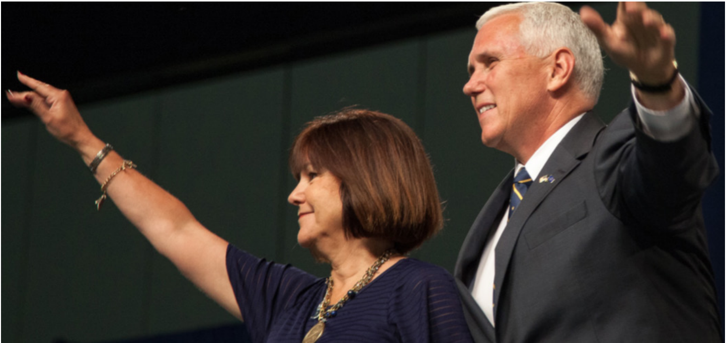
Gov. Mike Pence urged Indiana Republican Convention delegates to put Indiana “first on the board” last June.