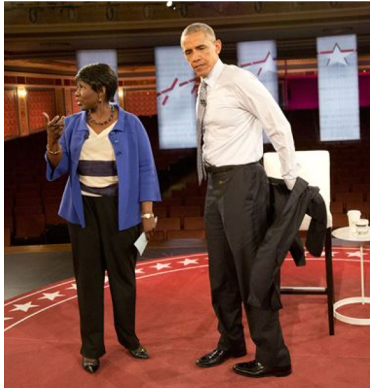
President Obama with Gwen Ifill at the Lerner Theater in Elkhart on Wednesday prior to a nationally televised town hall.

President Barack Obama joked, discussed the economy and talked about his waning presence on the basketball