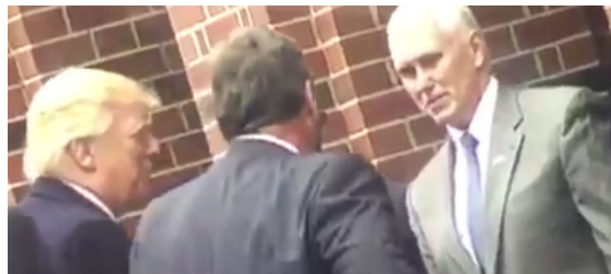
Gov. Mike Pence greets Donald Trump and New Jersey Gov. Chris Christie at the Governor's Residence in April. Pence said after the Indiana primary he would support and campaign with Trump.