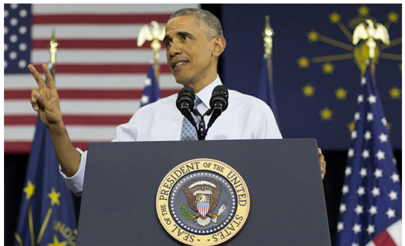
President Obama speaks at Concord HS in Elkhart on Wednesday, a return to his first visit as president in 2009.

“Fortunately, there’s another path that leads to more jobs. Higher wages. Better benefits. A stronger