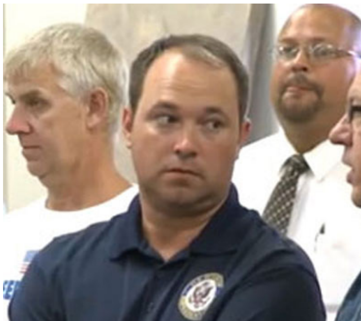
U.S. Rep. Marlin Stutzman reported $600,000 for the second quarter, coming in the middle of the $1 million raised by U.S. Rep. Todd Young and $200,000 raised by Eric Holcomb.