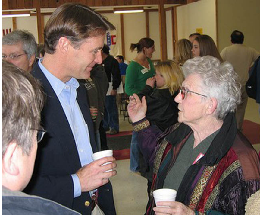
Then Sen. Evan Bayh campaigns in Iowa in 2006 before he abruptly pulled out of the race that December as the race boiled down to Hillary Clinton, Barack Obama and John Edwards.