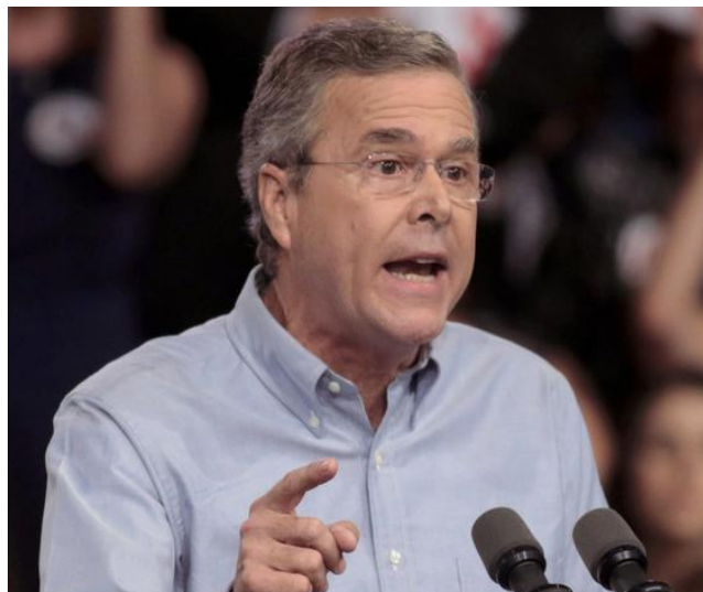
Hillary Clinton launches her campaign on Franklin D. Roosevelt Park in New York City on Saturday, while Jeb Bush did so Monday at Miami-Dade Community College.