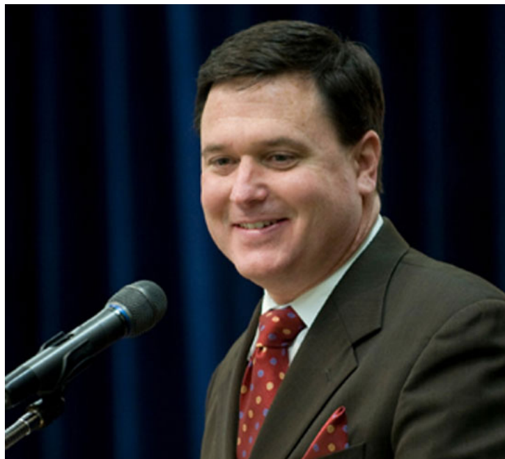
U.S. Rep. Todd Rokita says voting against TAA would have helped his "scores" but he took the "intellectually honest" course.

Rokita added: "Since I strongly believe that trade with other countries, where 96% of our potential customers reside, is essential for U.S. competitiveness across the globe, I voted for TAA as part of a larger trade package as the only intellectually honest choice, even though I am opposed to it as a standalone program. This vote demonstrates my commitment to free and fair trade." Messer supported TAA because it's the right policy,