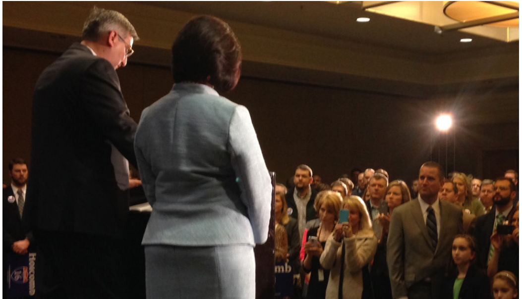
Senate candidate Eric Holcomb took a stance similar to his former boss, U.S. Sen. Dan Coats, who supported the trade deal.

Late Wednesday afternoon, House Speaker John Boehner, R-Ohio, and Senate Majority Leader Mitch McCon-