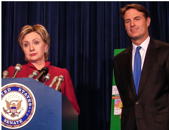
Purdue President Mitch Daniels (center, top photo) with Jeb and President Bush; Sens. Hillary Clinton and Evan Bayh in 2007.

ultimate swing at the stained glass ceiling. There will be talk of Evan Bayh finally ascending to the vice presidency (unlikely, unless she needs Indiana's 11 Electoral College votes) or into Hillary's cabinet (a better bet).