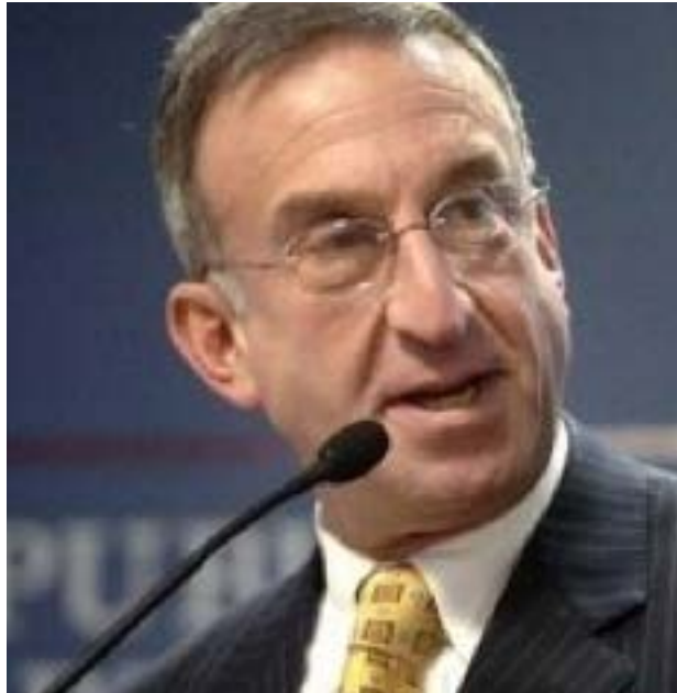
Allen County Republican Chairman opposes the proposed law.

Overall, only 13 of the 92 counties that track such data found Democrats casting the majority of straight-ticket ballots. It's widely accepted that straight party voting behavior is an essential component for Democrats within