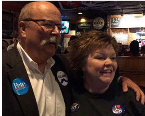
Democrat John Gregg greets voters in South Bend at the West Side Democratic Club on Dyngus Day.

If there's any good news in this scenario for Mike Pence, it probably comes along the lines of: If I can't beat these guys, then I don't deserve to be governor. ❖