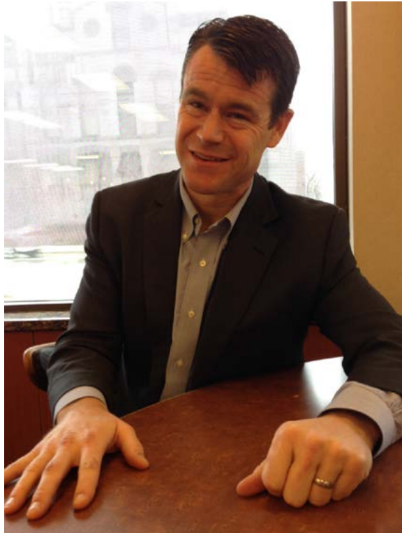
U.S. Rep. Todd Young chats with HPI at Shapiro’s Deli on Tuesday.

Rep. Brooks called the open Senate seat “a once-in-a-lifetime opportunity.” She told the Anderson Herald-Bulletin on Tuesday, “I’m really interested in exploring it and hopefully making that decision in the near future.” Walorski is in a similar mode, telling the Elkhart Truth during her Dyngus Day stops that like Brooks she is talking to supporters and family. “Do you have a better opportunity