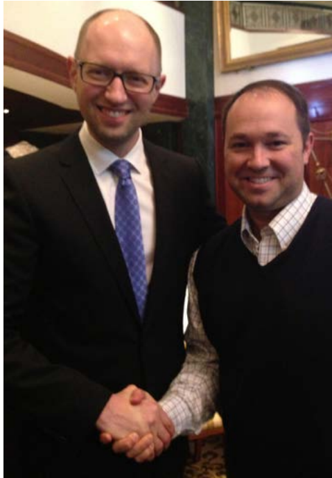
U.S. Rep. Marlin Stutzman meets with Ukraine Prime Minister Arseniy Yatsenyuk this past week.