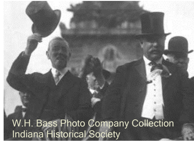
1917, Cole 860, Indiana State Library Pamphlet Collection

It must have worked! Reportedly, over 10,000 people came to Indianapolis on October 12, 1916 to hear President Wilson give a speech on the need for improved roads and enjoy an automobile parade.