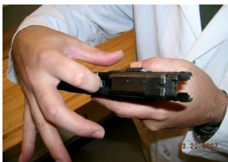
Step 5: Physically inspect the chamber