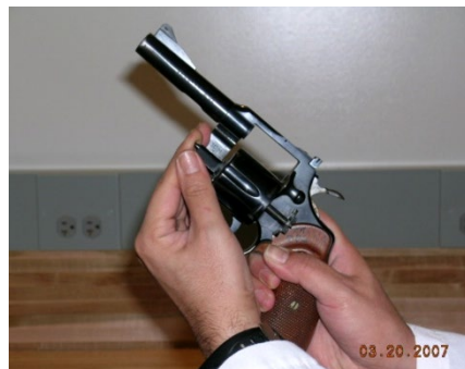
Step 2: Eject any cartridges from chambers