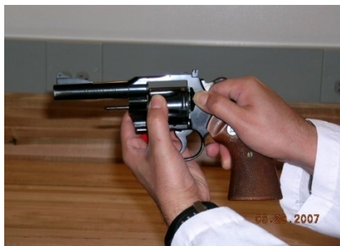
Step 1: Open cylinder