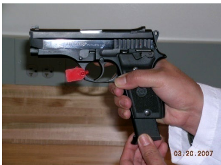
Step 1: Remove the Magazine