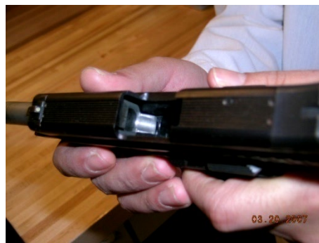
Step 4: Visually inspect the chamber