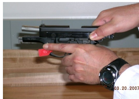
Step 2: Rack the slide to the rear at least 3 times