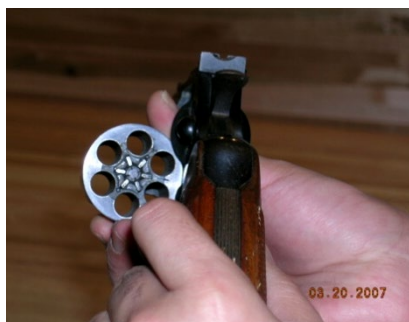
Step 3: Visually and physically check all chambers