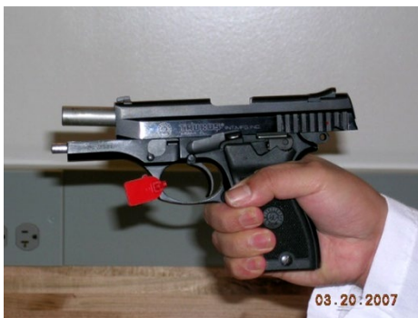
Step 3: Lock the slide to the rear