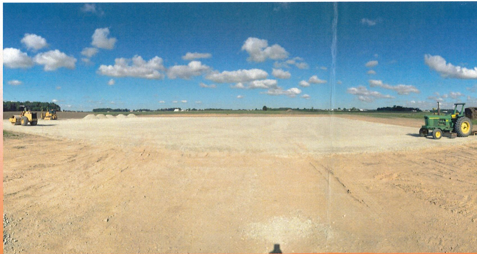
Community Emergency Lagoon (CEL)