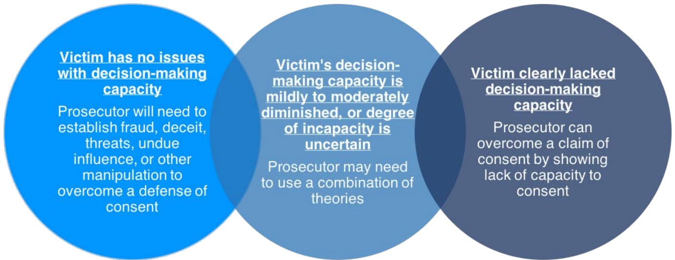
Figure 1. Prosecutorial Evaluation of Victim's Decision-Making Capacity