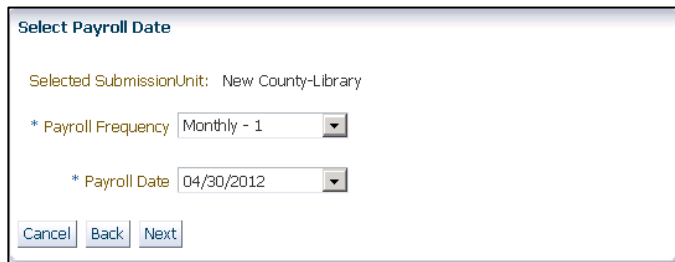
Figure 2: Select Payroll Date Screen