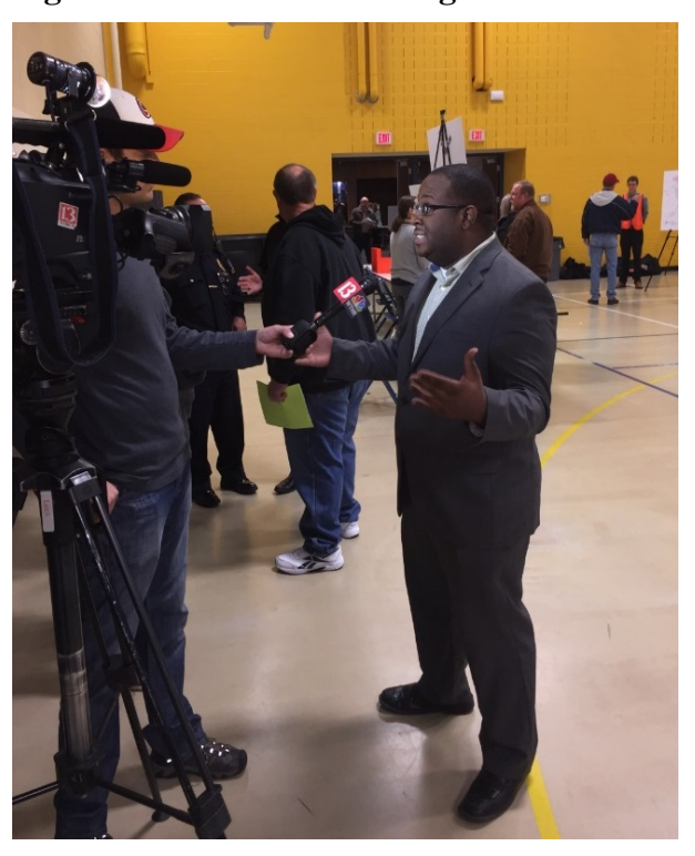
Figure 11-4: Public Information Meeting at Martinsville High School