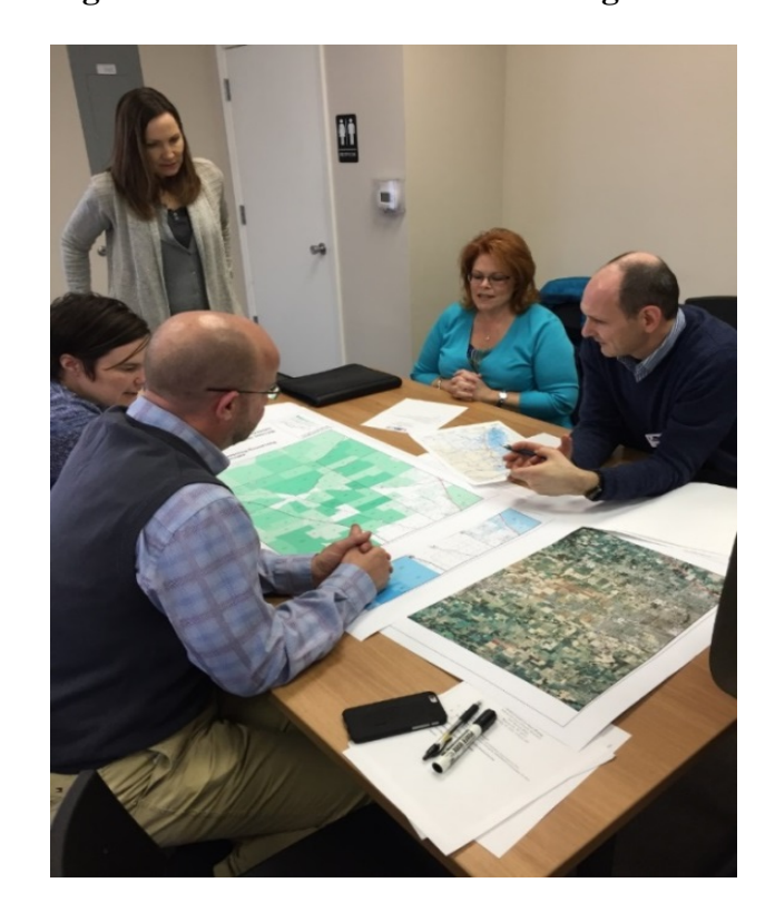
Figure 11-1: Land Use Panel Meeting

This information was used in the development and refinement of alternatives to provide optimum access to growing areas while minimizing impacts to future growth patterns. The I-69 Section 6 land use panel was comprised of local professionals familiar with development activity in the communities served by I-69. Members are involved in the public development approval process or in the development of major residential or commercial areas and included representatives of city and county planning departments, real estate zoning and professionals, and economic development groups. The expert land use panel held meetings on September 29, 2015, and February 29, 2016.