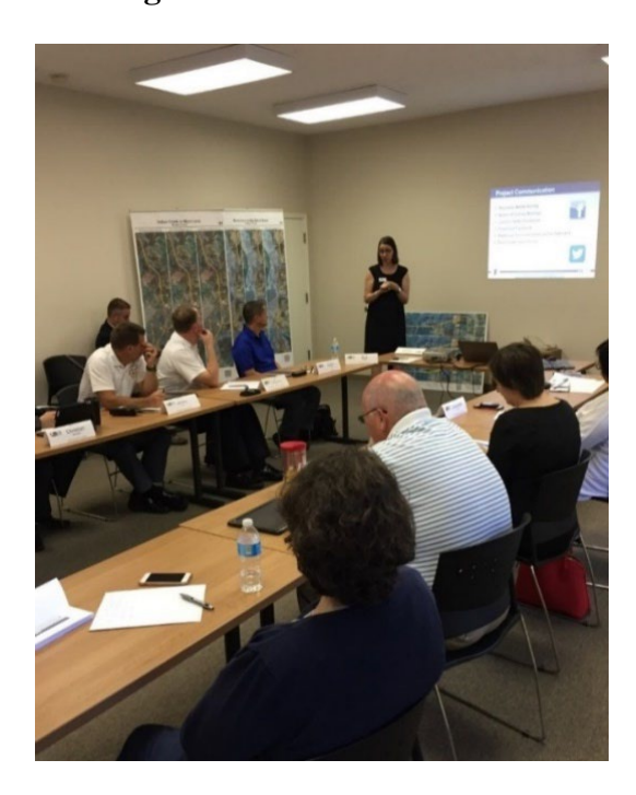
Figure 11-2: Community Advisory Meeting

The fourth meeting was also a combined CAC North, CAC South, and SWG meeting. It was held at Perry Meridian High School prior to the November 30, 2015, public information meeting. Committee members were updated on modifications to the preliminary alternatives and