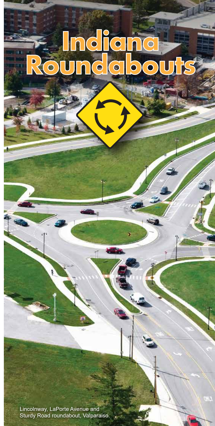
Lincolnway, LaPorte Avenue and Sturdy Road roundabout, Valparaiso.