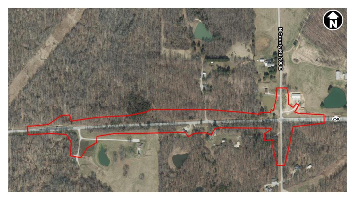
Figure 2: Project Limits – SR 258 from 0.5 mile west of N CR 100 E to 500 feet east of N CR 100E

The project is estimated to have a construction cost of $3,500,000. New right-of-way will be acquired from 12 properties. The project is expected to start construction in the fall of 2023 and is scheduled to be complete at the end of 2025.