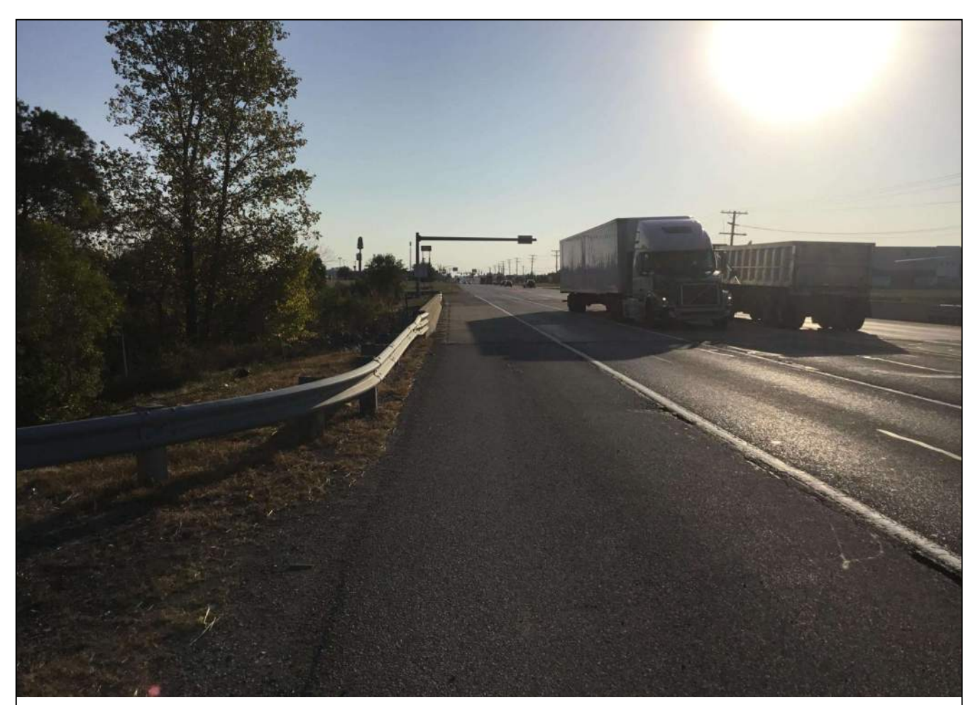
1. Looking east at the eastern project terminus from the westbound shoulder of SR 32. Photo taken October 7, 2020.