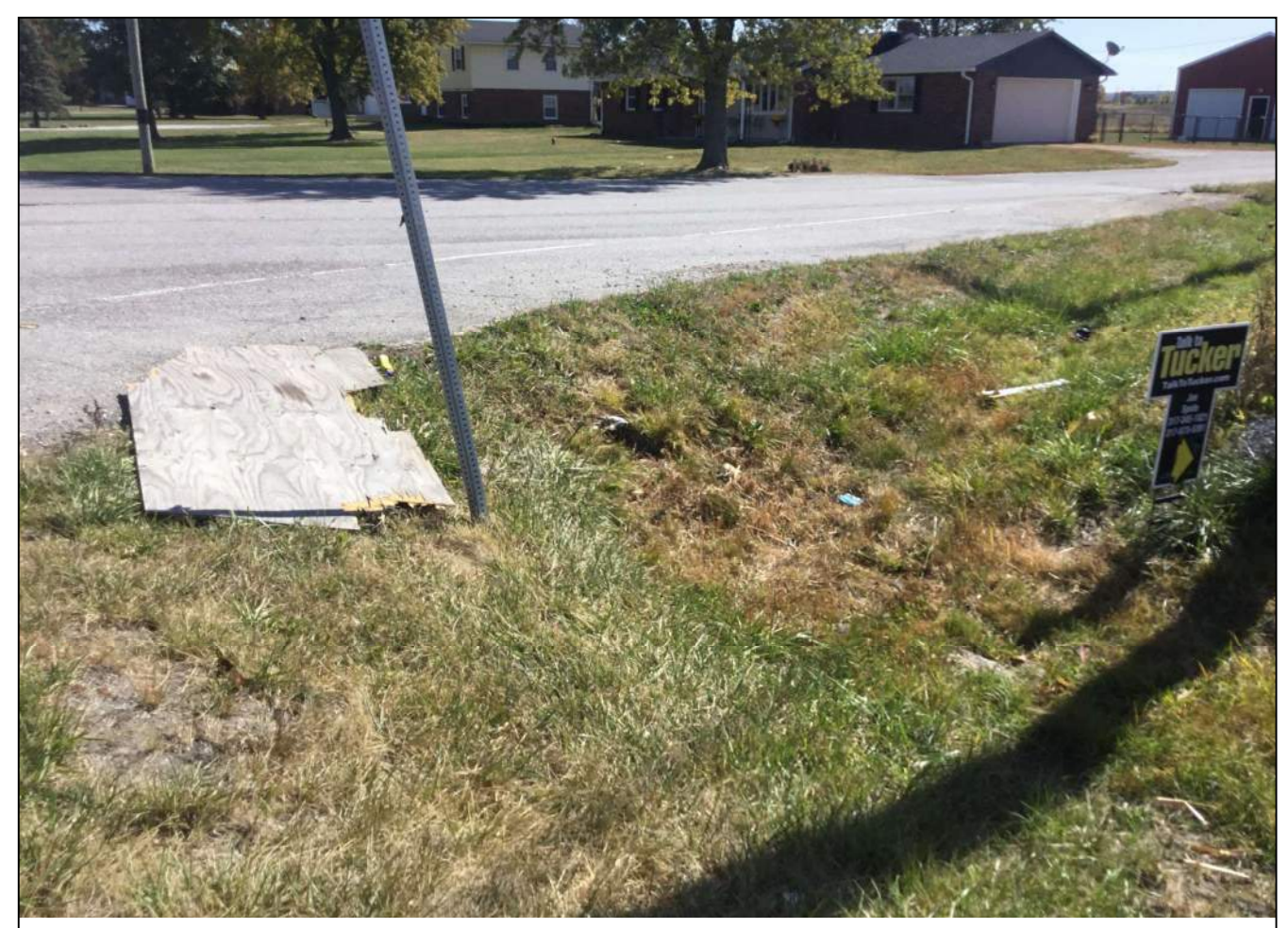
Looking southeast from the EB shoulder of SR 32 at the CR S. 200 W. intersection. Photo taken October 8, 2021.