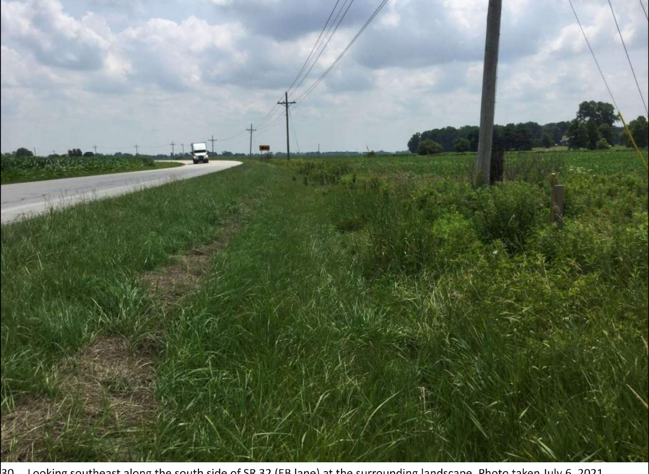
30. Looking southeast along the south side of SR 32 (EB lane) at the surrounding landscape. Photo taken July 6, 2021.