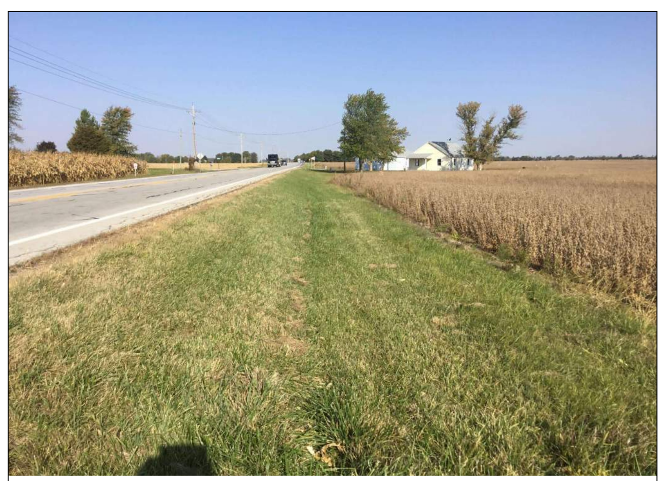
33. Looking northwest along the north side of SR 32 (WB lane) at the surrounding landscape. Photo taken October 7, 2020.