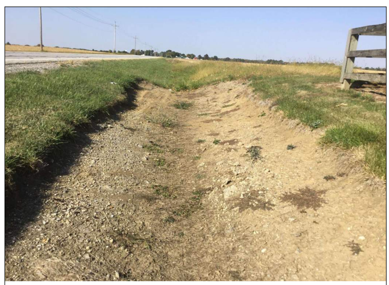
51. Looking west along the north side of SR 32 (WB lane) at the surrounding landscape. Photo taken October 7, 2020.