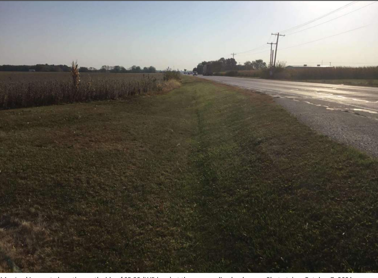
14. Looking east along the north side of SR 32 (WB lane) at the surrounding landscape. Photo taken October 7, 2021.