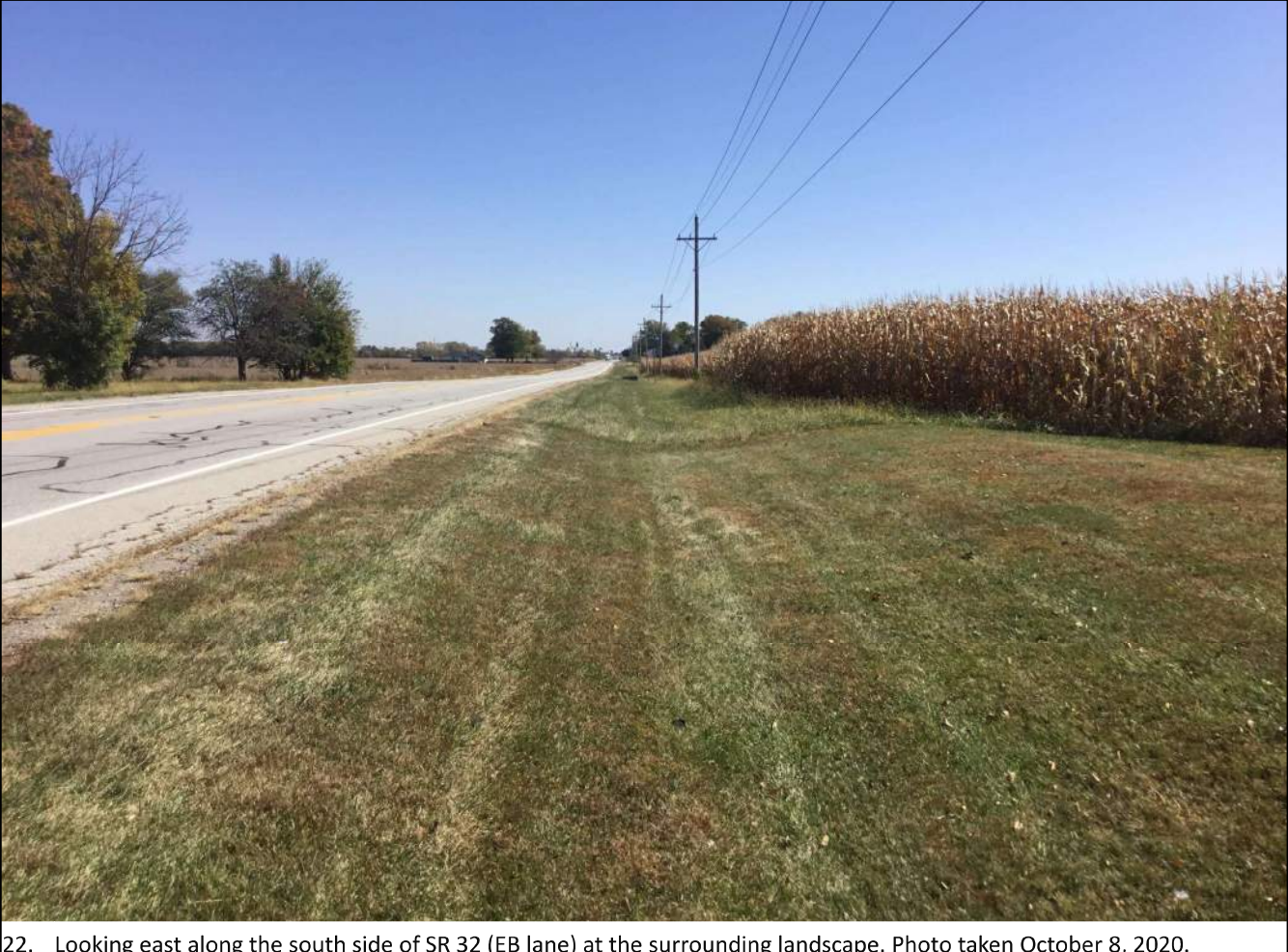
22. Looking east along the south side of SR 32 (EB lane) at the surrounding landscape. Photo taken October 8, 2020.