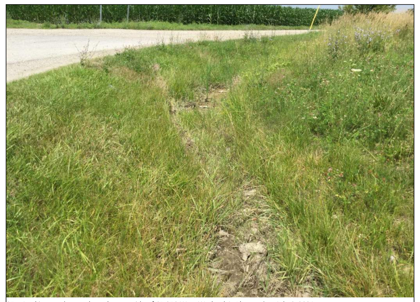
25. Looking northwest along the east side of CR 250 W. at Wetland A. Photo taken July 6, 2021.