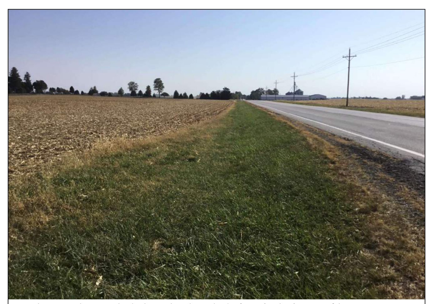
Looking east at the surrounding landscape along the north side of SR 32 (WB lane) just east of the CR 400 W. intersection. Photo taken July 6, 2021.