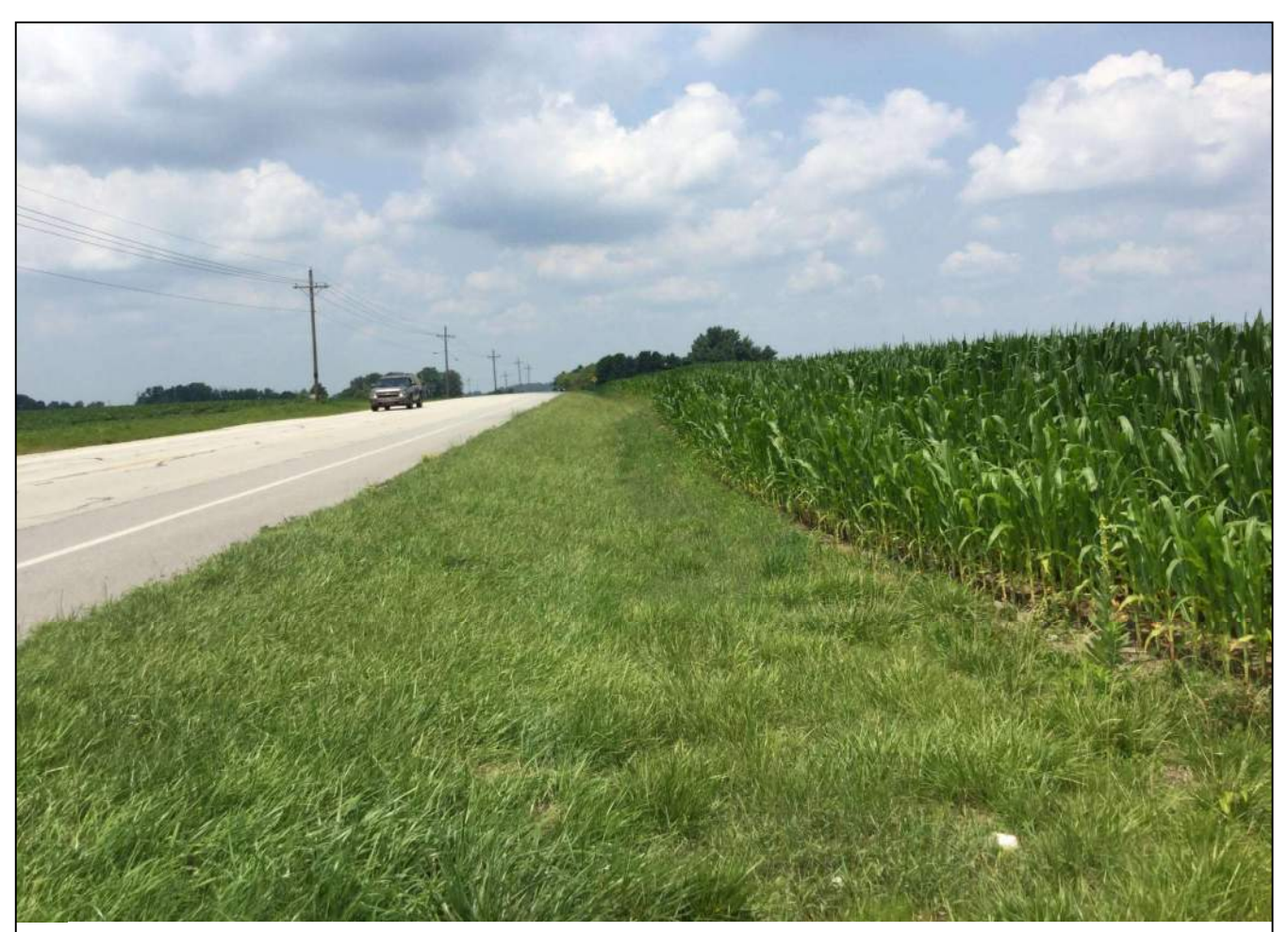
37. Looking northwest along the north side of SR 32 (WB lane) at the surrounding landscape. Photo taken July 6, 2021.