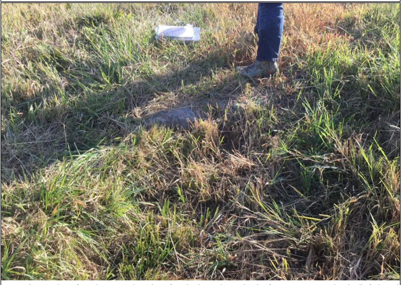
26. Looking northeast from the western boundary of Wetland B on the north side of SR 32 at a concrete headwall of a buried culvert pipe under CR 250 W. Photo taken October 7, 2020.