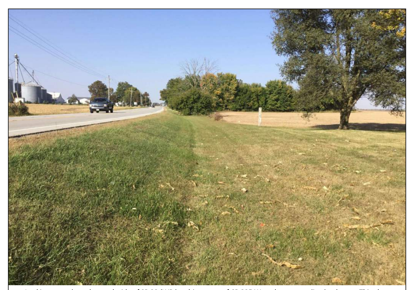
Looking west along the north side of SR 32 (WB lane) just west of CR 325 W. at the surrounding landscape. This also 43. denotes the beginning of the first WB passing lane. Photo taken October 7, 2020.