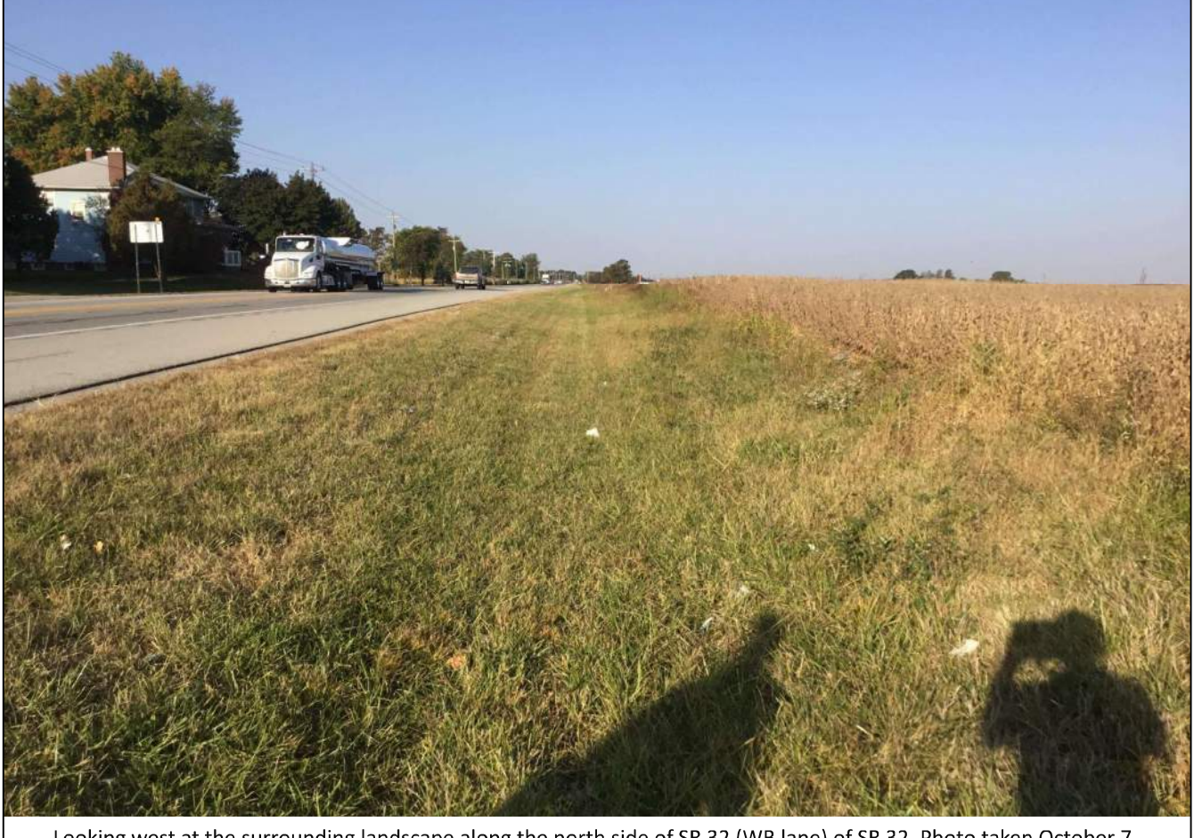
Looking west at the surrounding landscape along the north side of SR 32 (WB lane) of SR 32. Photo taken October 7, 2020.

Lead Des No. 1800060 Appendix B: Graphics B56 of 210