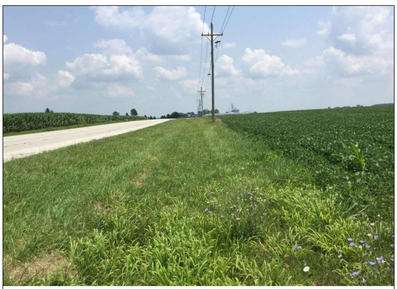
59. Looking east along the south side of SR 32 (EB lane) at the surrounding landscape. Photo taken July 6, 2021.