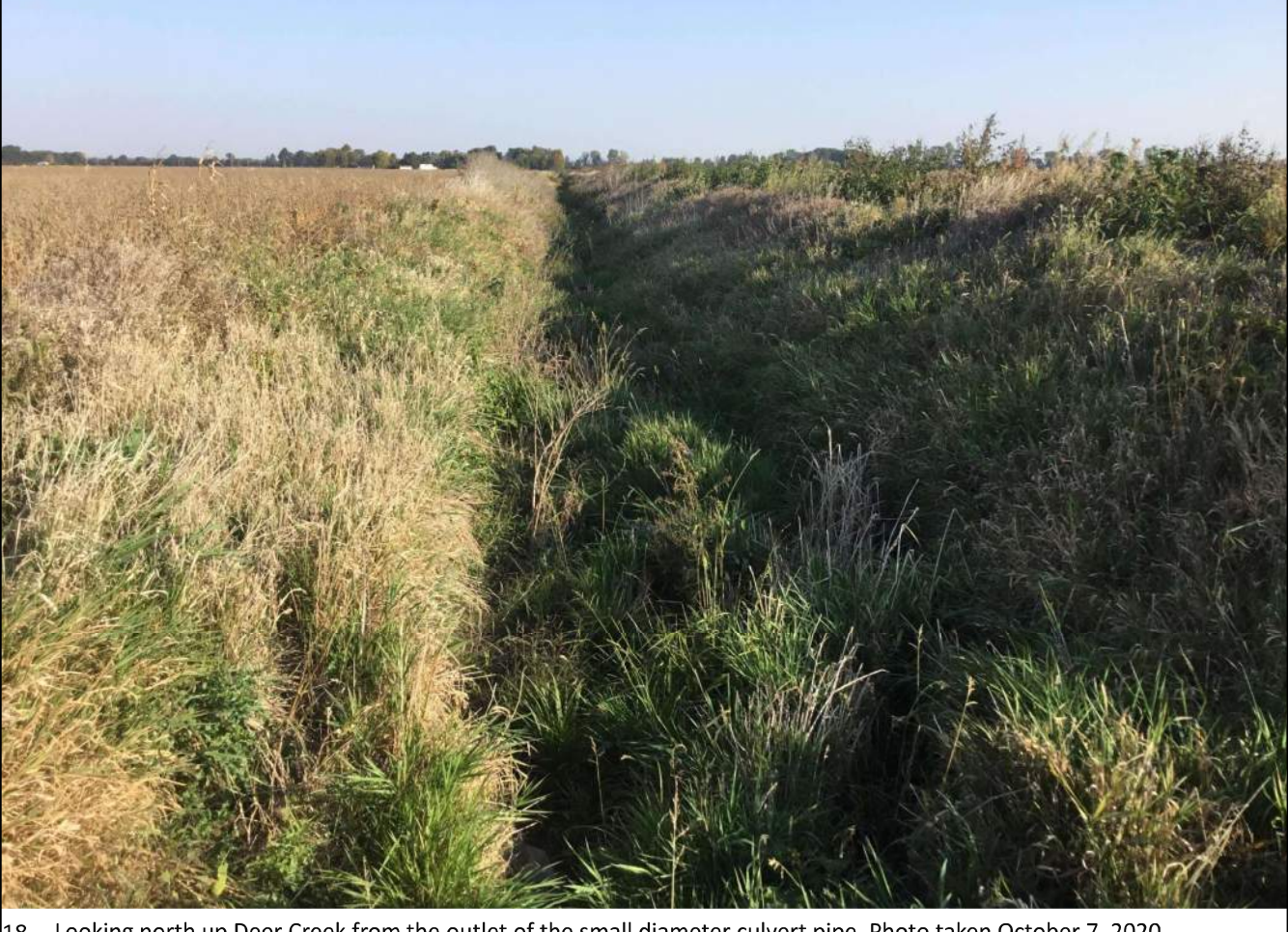
18. Looking north up Deer Creek from the outlet of the small diameter culvert pipe. Photo taken October 7, 2020.