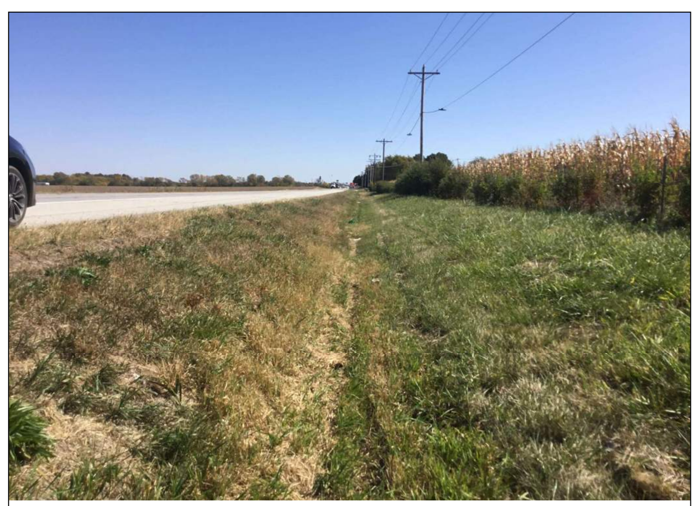
13. Looking east at the surrounding landscape along the south side of SR 32 (WB lane). Photo taken October 8, 2021.