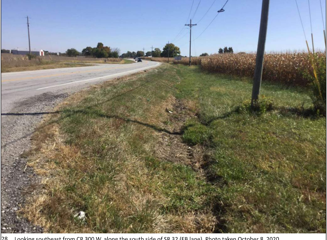
28. Looking southeast from CR 300 W. along the south side of SR 32 (EB lane). Photo taken October 8, 2020.