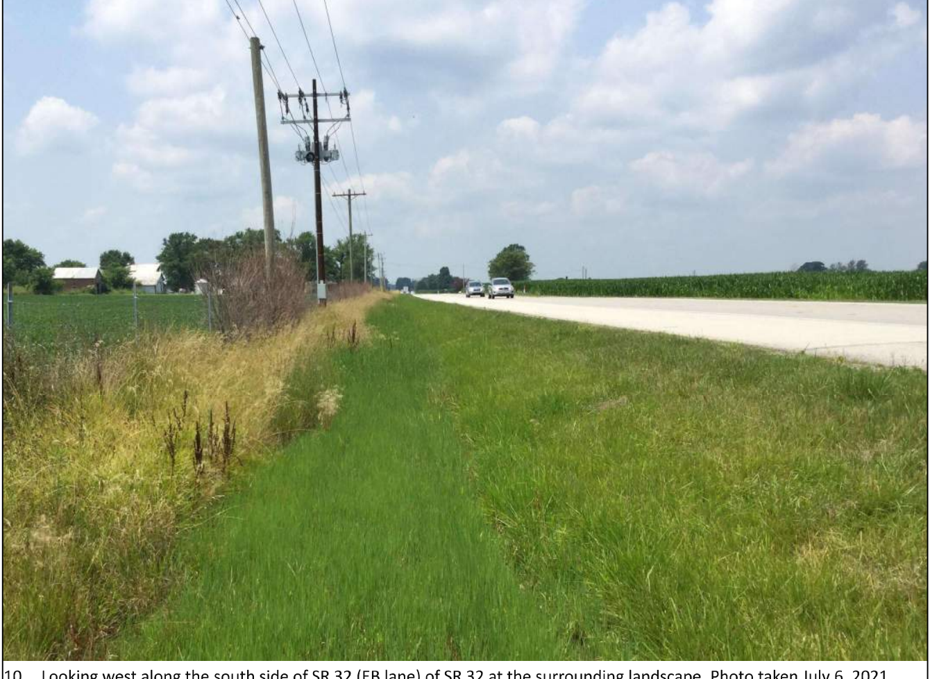
10. Looking west along the south side of SR 32 (EB lane) of SR 32 at the surrounding landscape. Photo taken July 6, 2021.