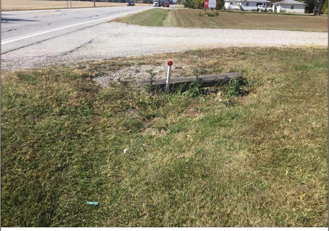
66. Looking west at the surrounding landscape located along the north side of SR 32 (WB lane). Photo taken October 7, 2020.