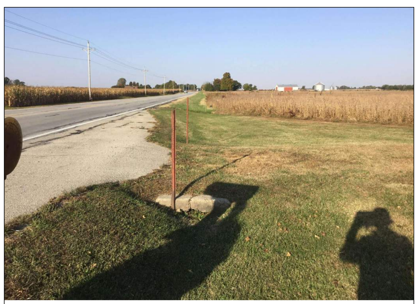
15. Looking west along the north side of SR 32 (WB lane) at the surrounding landscape. Photo taken October 7, 2021.