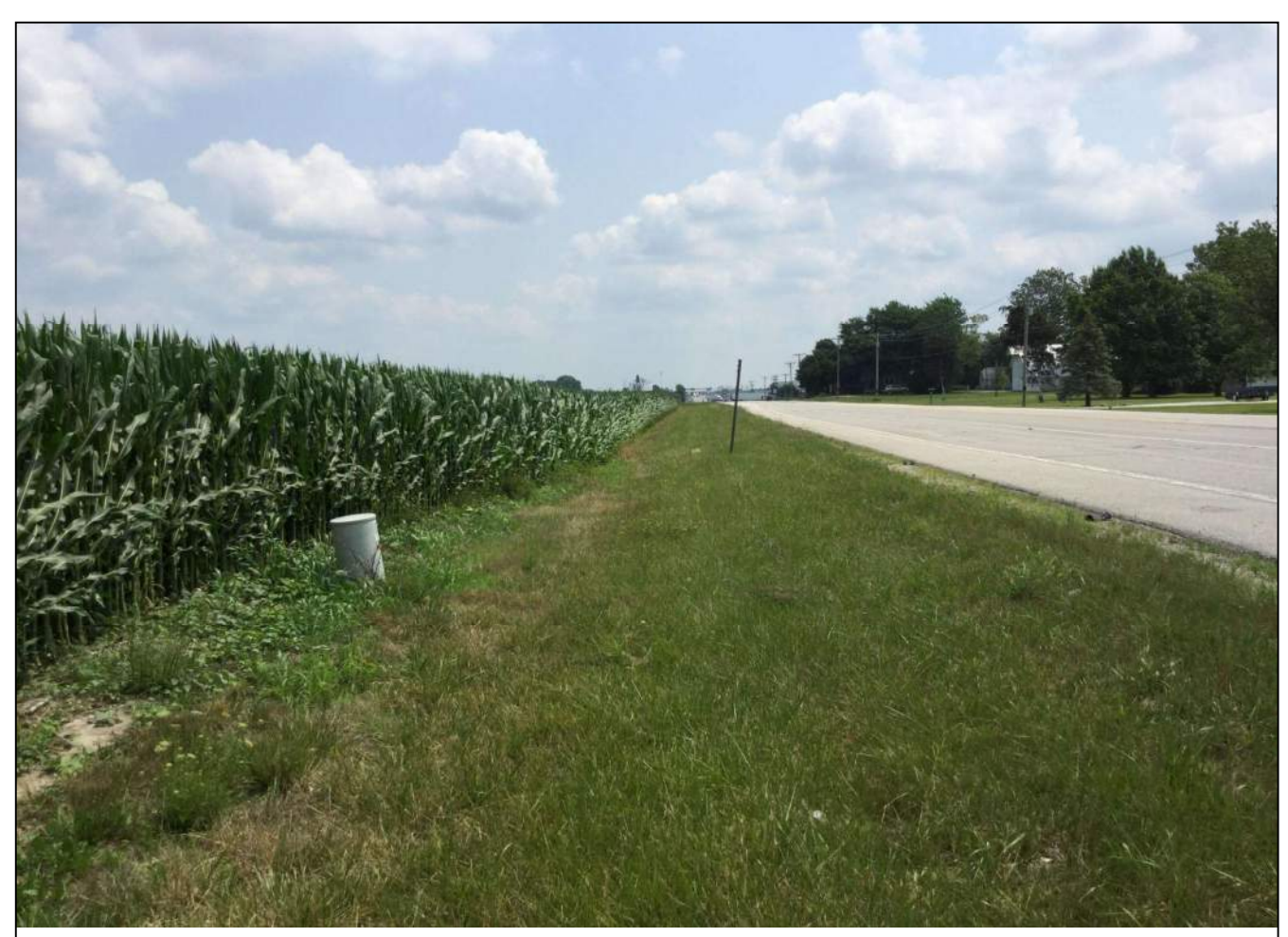
11. Looking east along the north side of SR 32 (WB lane) at the surrounding landscape. Photo taken July 6, 2021.