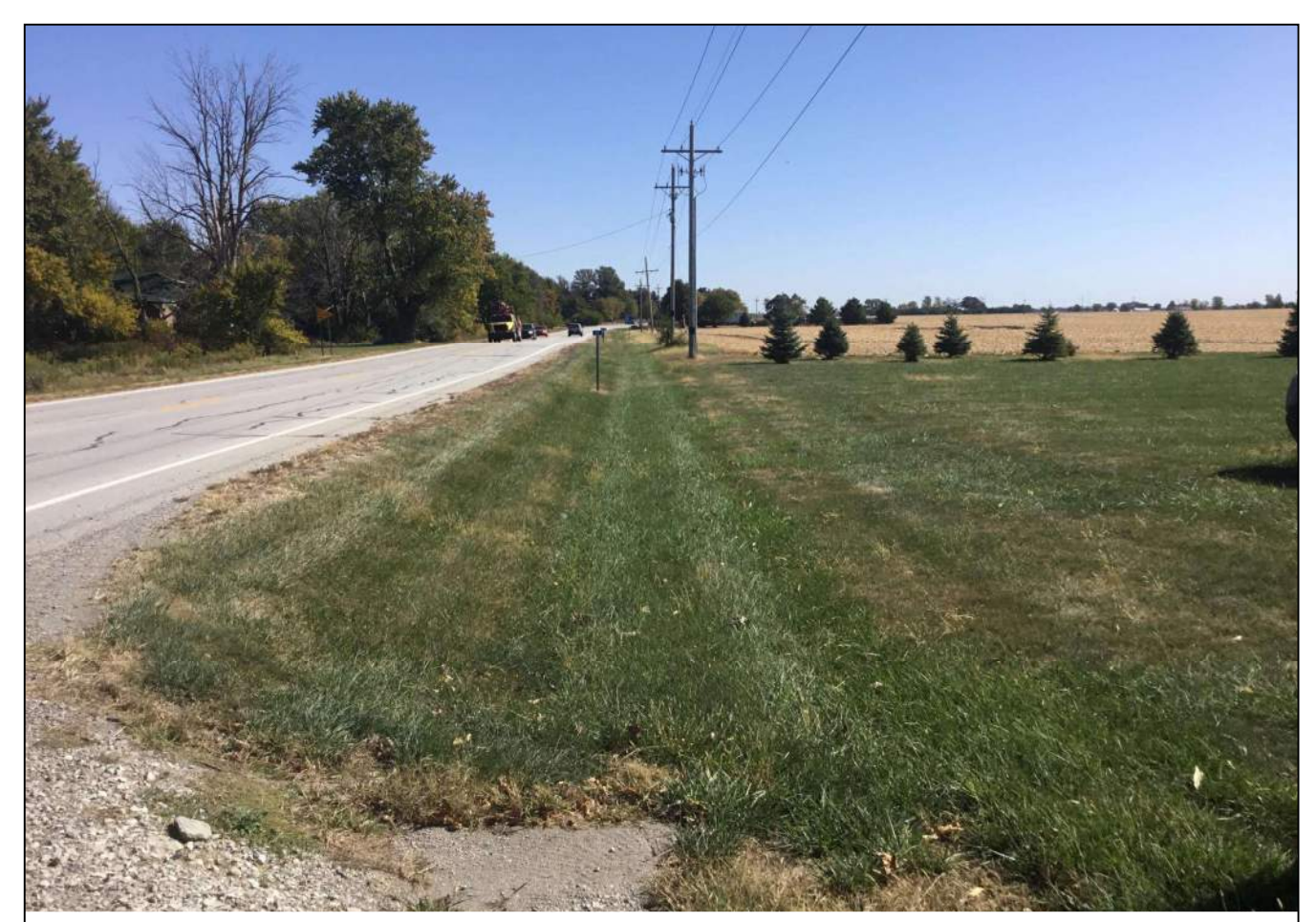
Looking east along the south side of SR 32 (EB lane) from a shared residential/agricultural drive. Photo taken October 8, 2020.