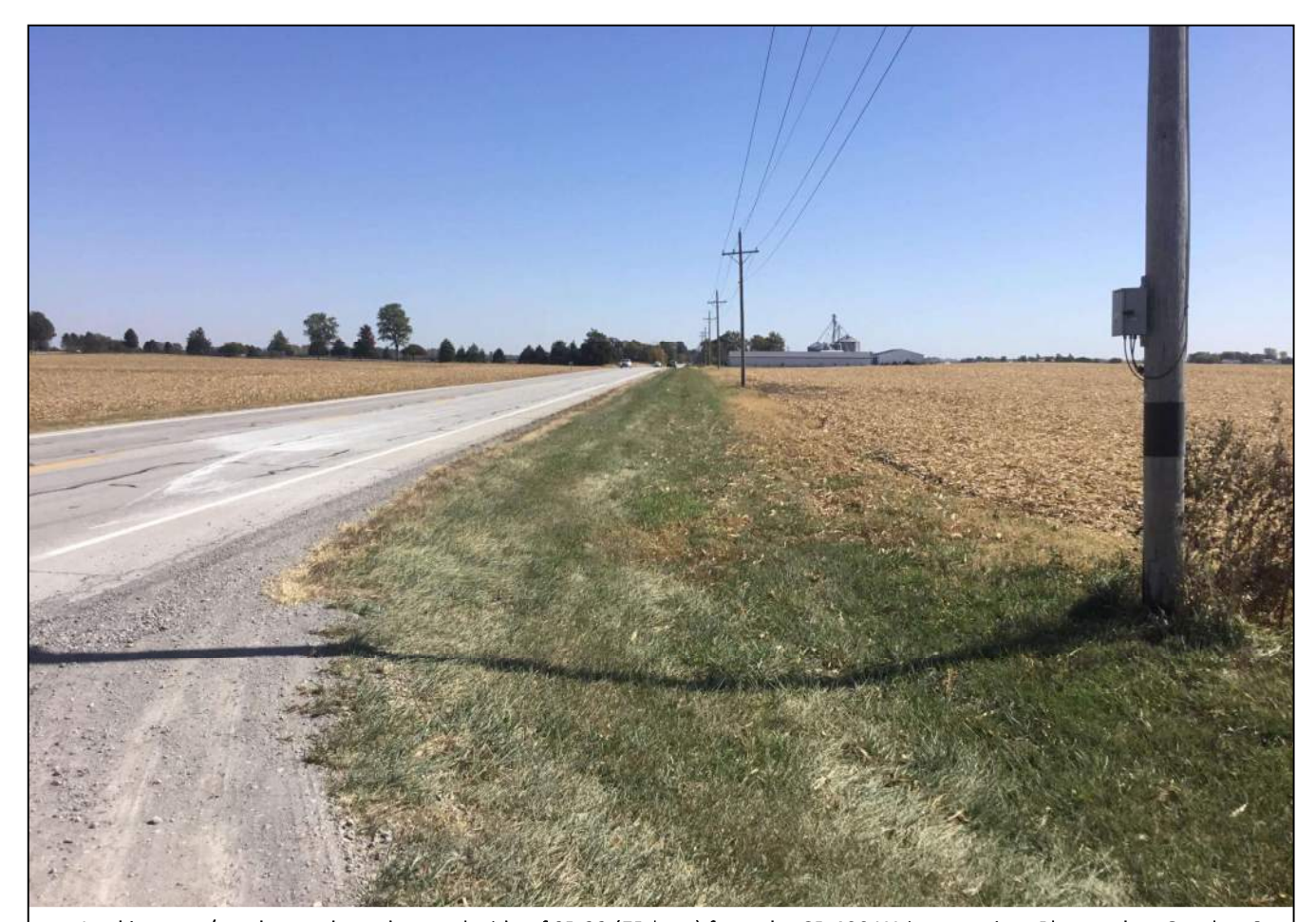
Looking east/northeast along the south side of SR 32 (EB lane) from the CR 400 W. intersection. Photo taken October 8, 55. 2020.