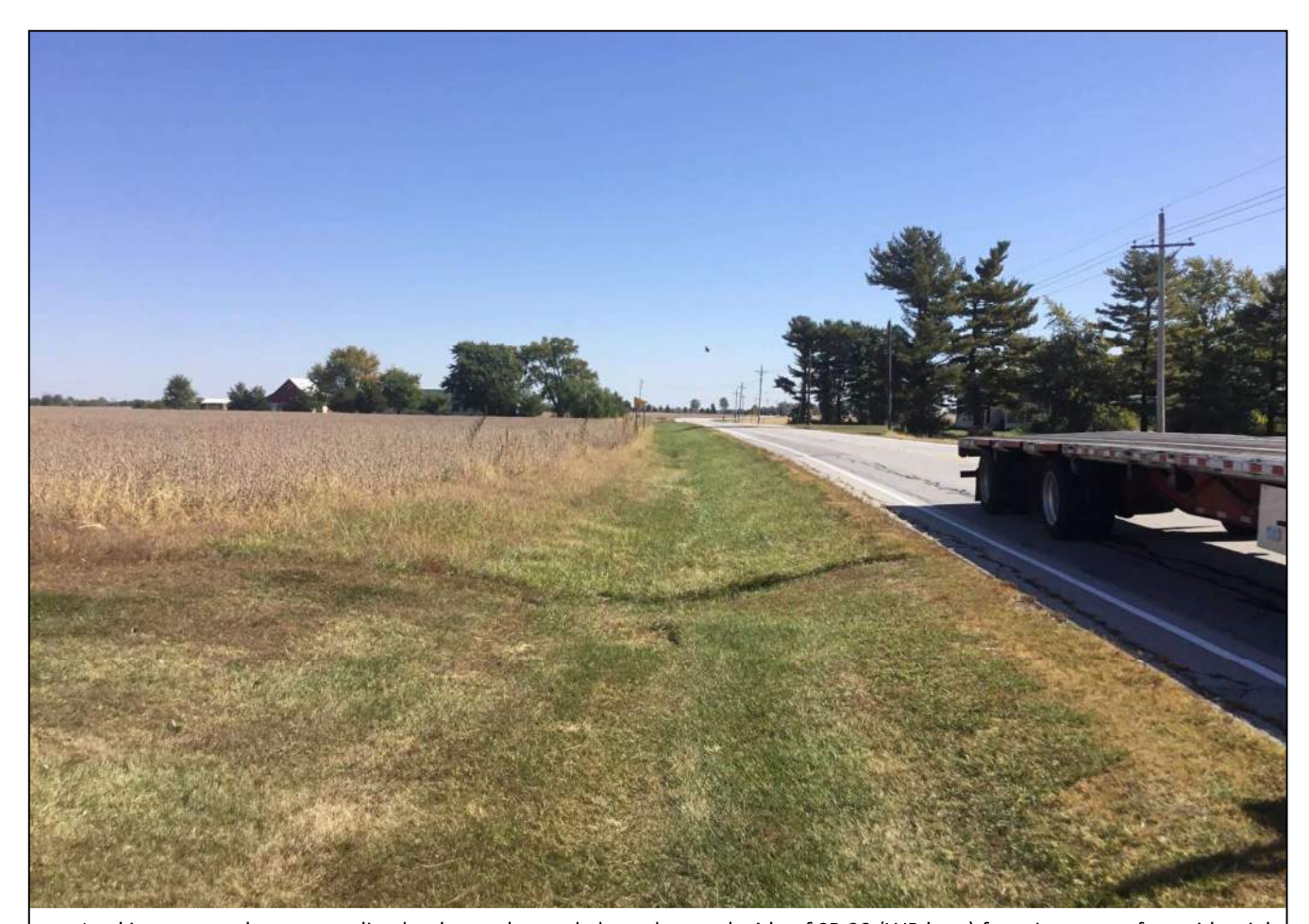
65. Looking east at the surrounding landscape located along the north side of SR 32 (WB lane) from just east of a residential drive. Photo taken October 7, 2020.