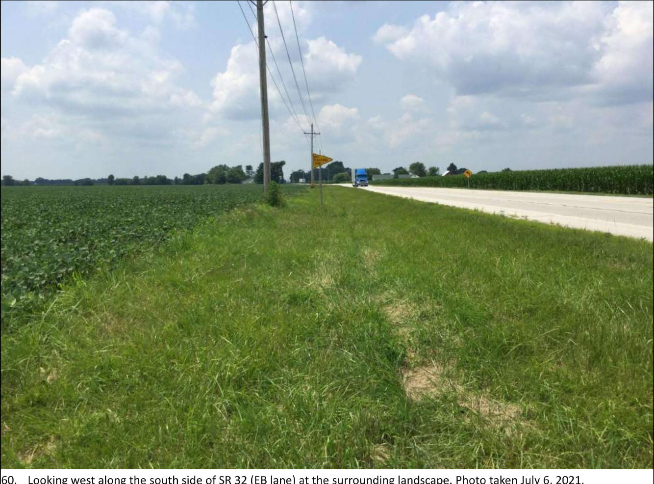
60. Looking west along the south side of SR 32 (EB lane) at the surrounding landscape. Photo taken July 6, 2021.