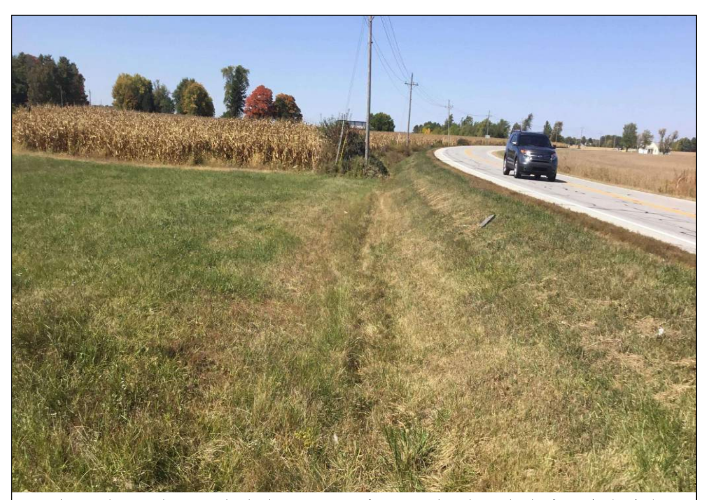
Looking northwest at the surrounding landscape, just west of CR 300 W. along the south side of SR 32 (EB lane). Photo 29. taken October 7, 2020.