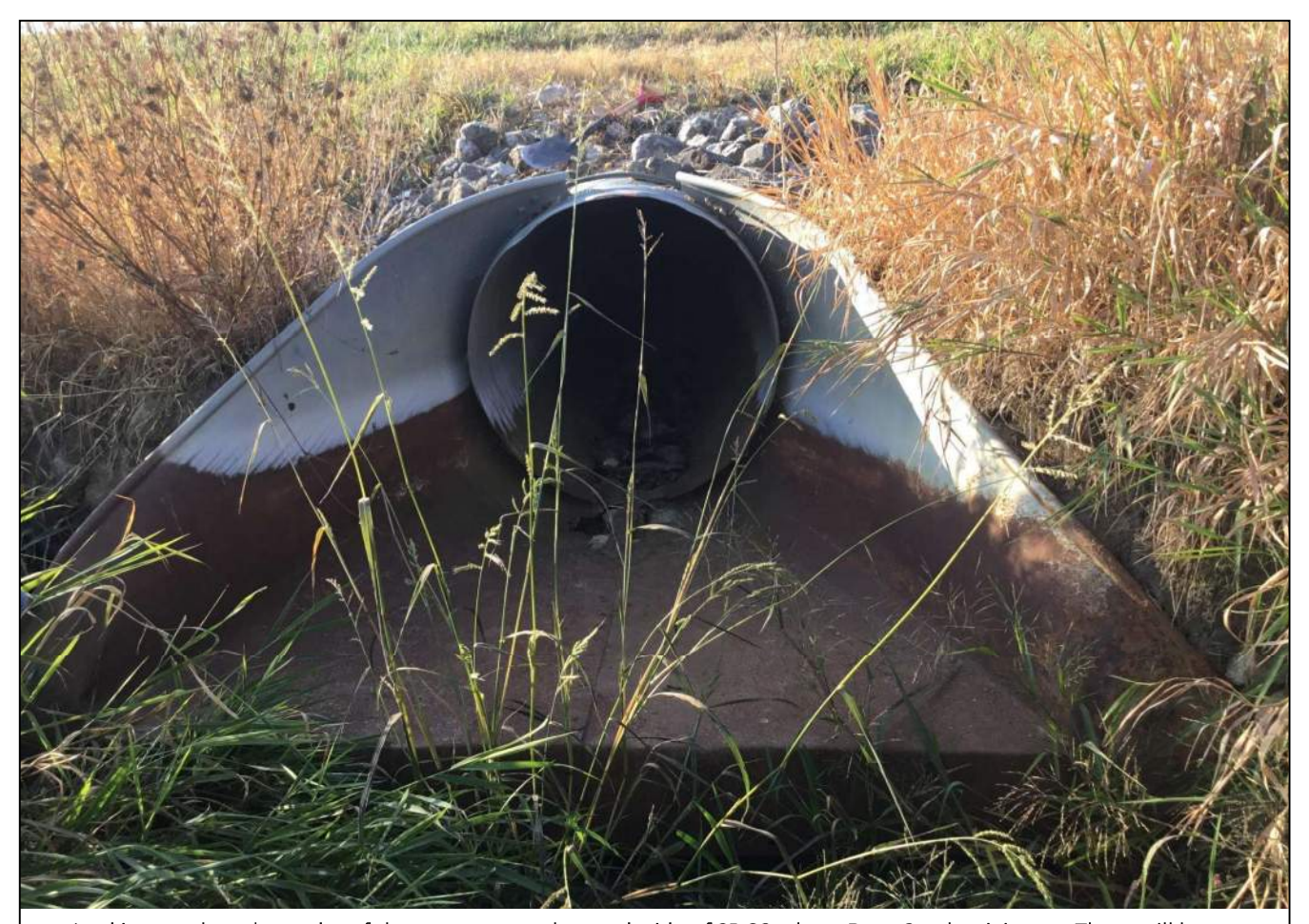
Looking south at the outlet of the structure on the north side of SR 32 where Deer Creek originates. There will be no impacts to Deer Creek or this structure as part of this project. Photo taken October 7, 2020.