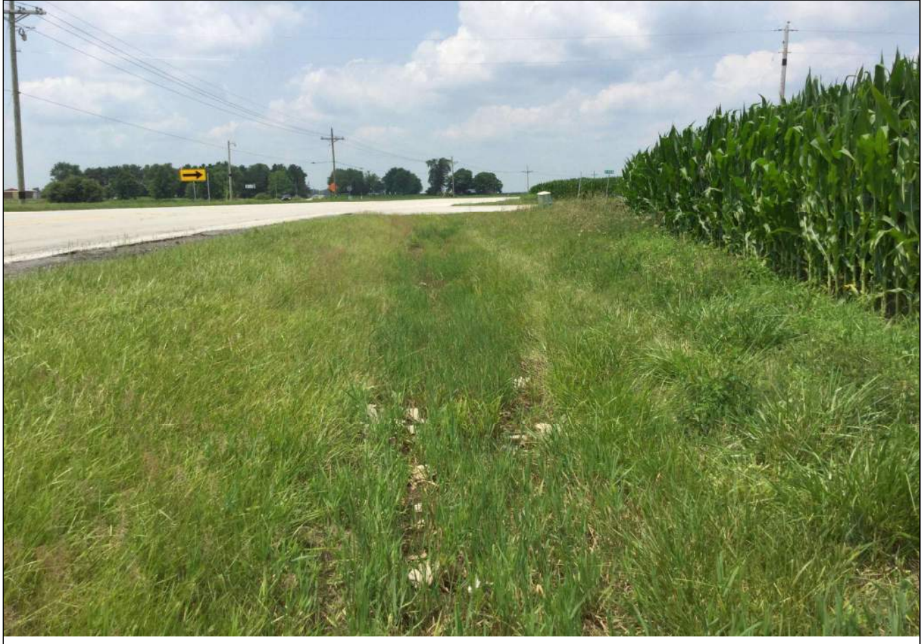
Looking west along the north side of SR 32 (WB lane) at Wetland A. No impacts to Wetland A will occur as a result of this project. Photo taken July 6, 2021.

23. Looking west along the south side of SR 32 (EB lane) at the surrounding landscape. Photo taken October 8, 2020.