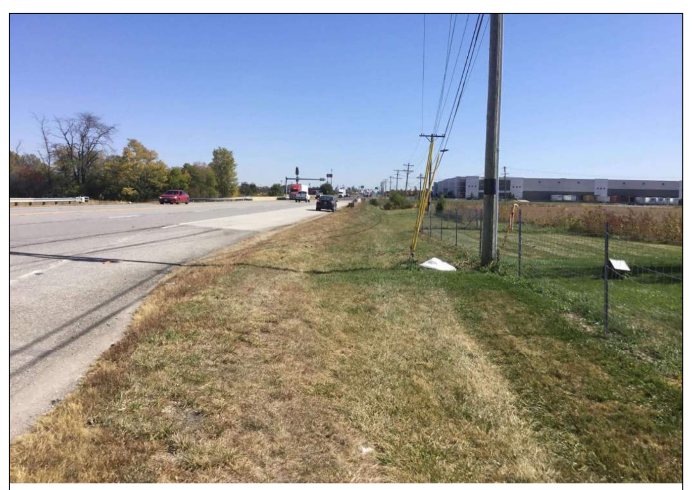
3. Looking east from Enterprise Blvd. at the surrounding landscape along the EB lanes of SR 32. Photo taken October 8, 2020.