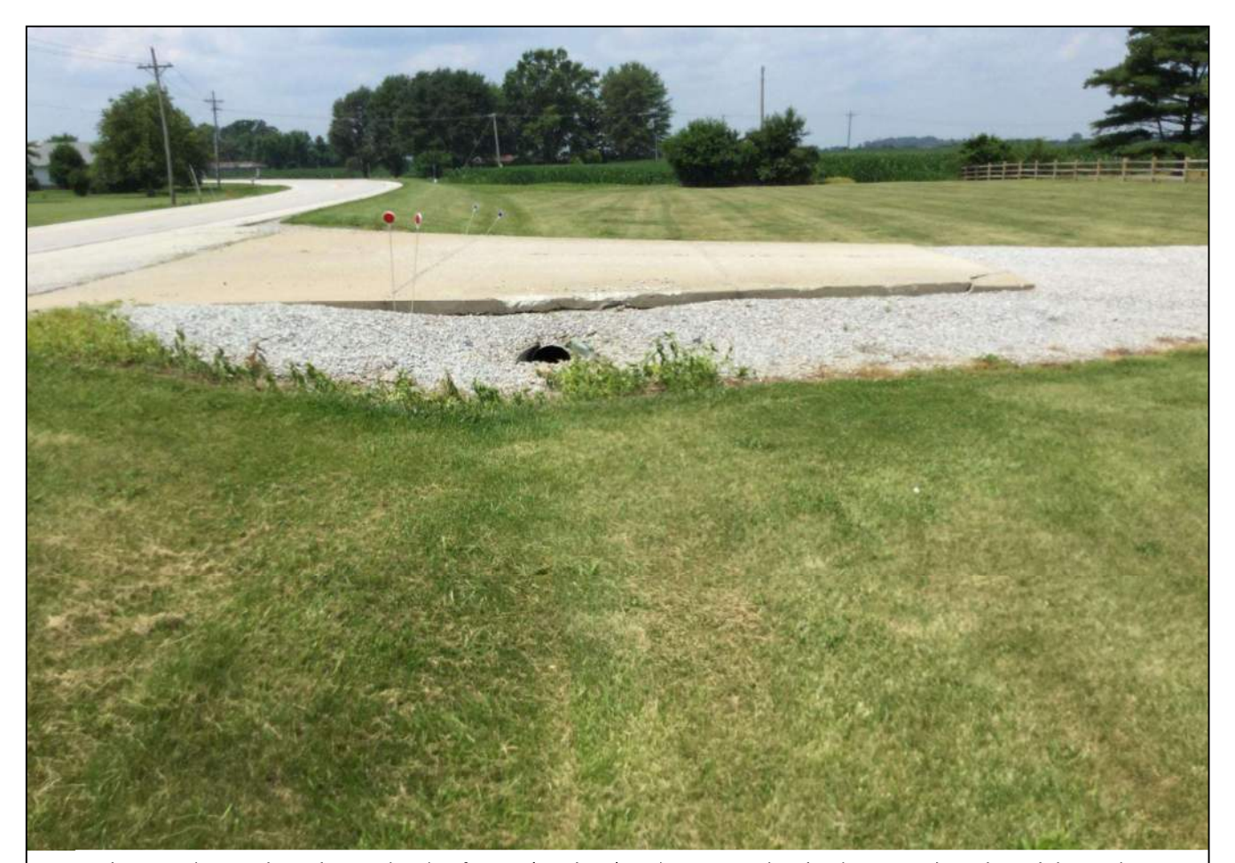
39. Looking northwest along the north side of SR 32 (WB lane) at the surrounding landscape and residential drive. Photo taken July 6, 2021.