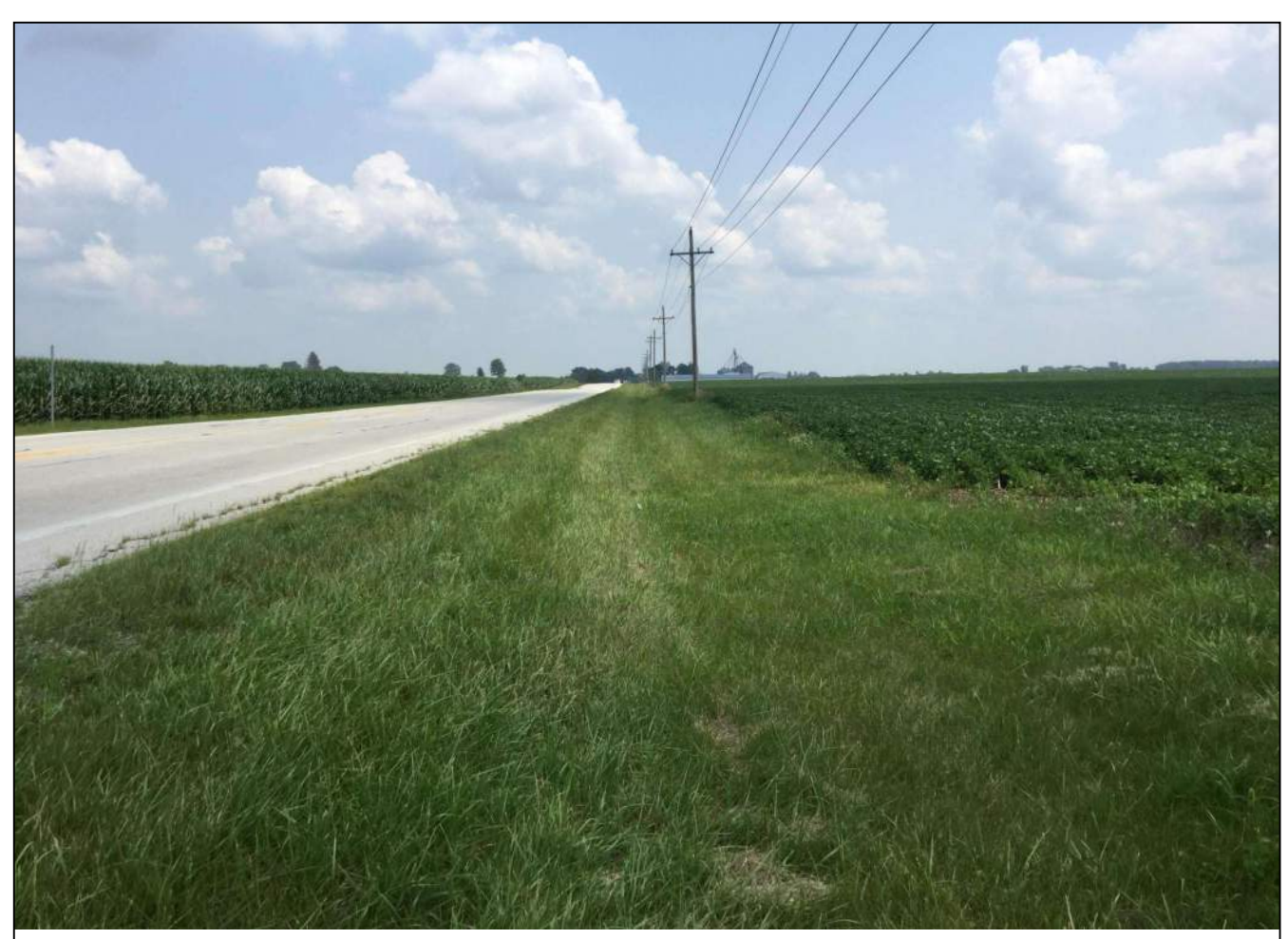
61. Looking east along the south side of SR 32 (EB lane) at the surrounding landscape. Photo taken July 6, 2021.