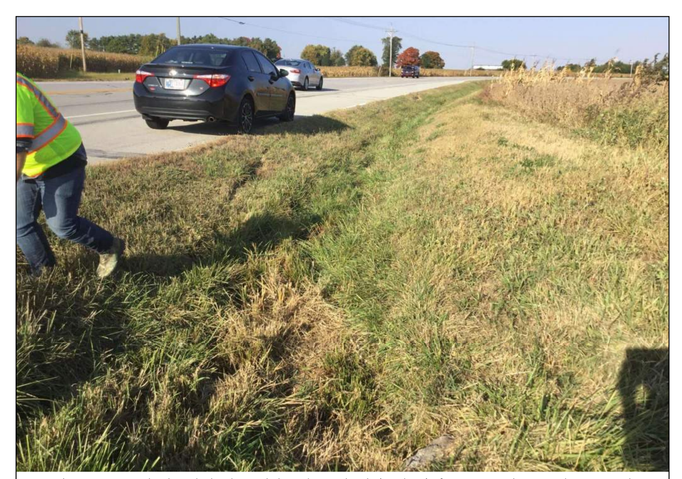
Looking west at Wetland B, which is located along the north side (WB lane) of SR 32. Note the mowed over cat-tails in 27. the photo. No impacts to Wetland B will occur as a result of this project. Photo taken October 7, 2020.