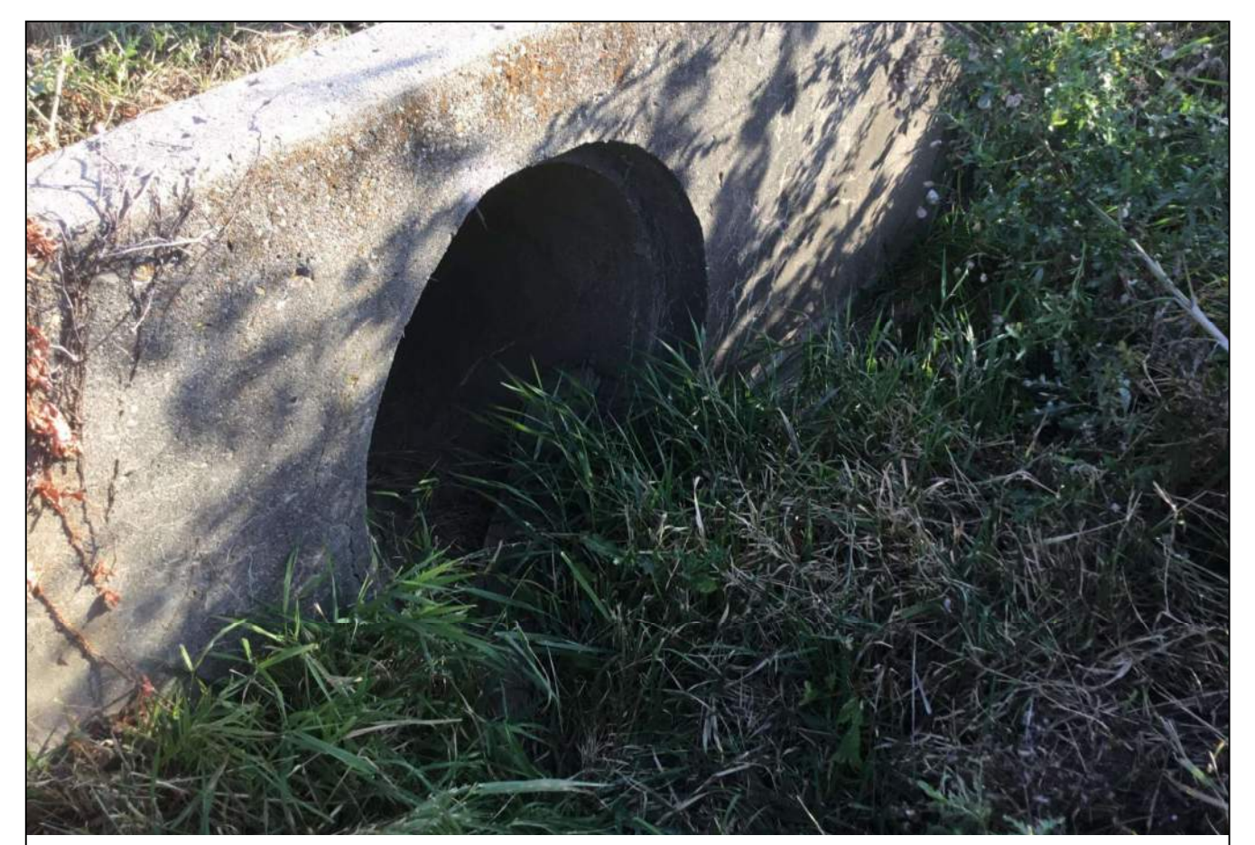
Looking at a close up of the inlet side of small diameter culvert pipe. No stream channel or wetland feature was observed on the inlet side of the structure. No impacts to this structure will occur as a result of this project. Photo taken October 7, 2020.