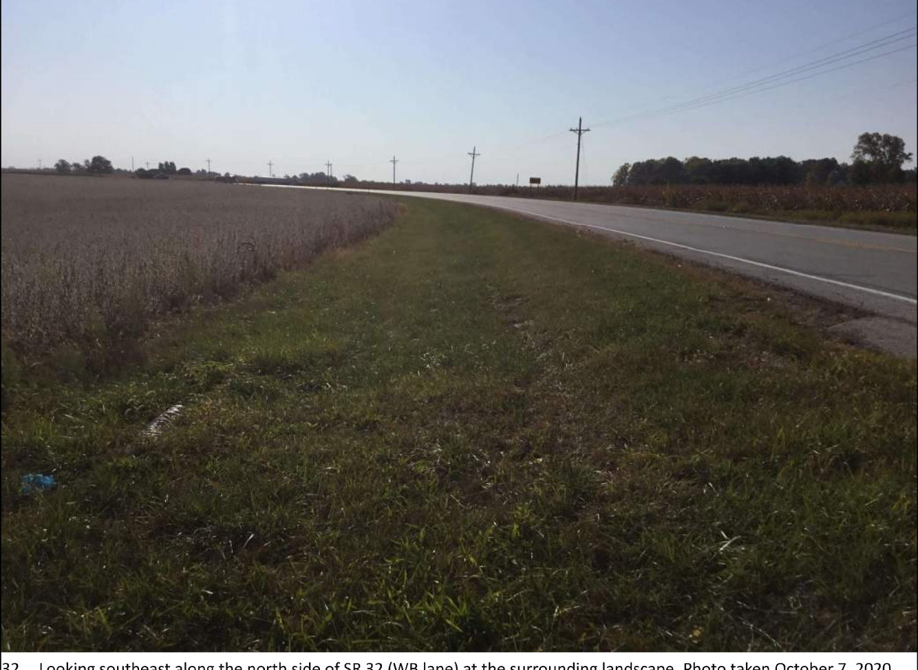
32. Looking southeast along the north side of SR 32 (WB lane) at the surrounding landscape. Photo taken October 7, 2020.