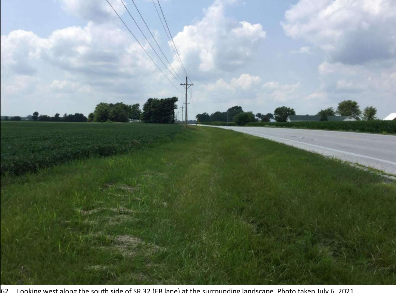
62. Looking west along the south side of SR 32 (EB lane) at the surrounding landscape. Photo taken July 6, 2021.