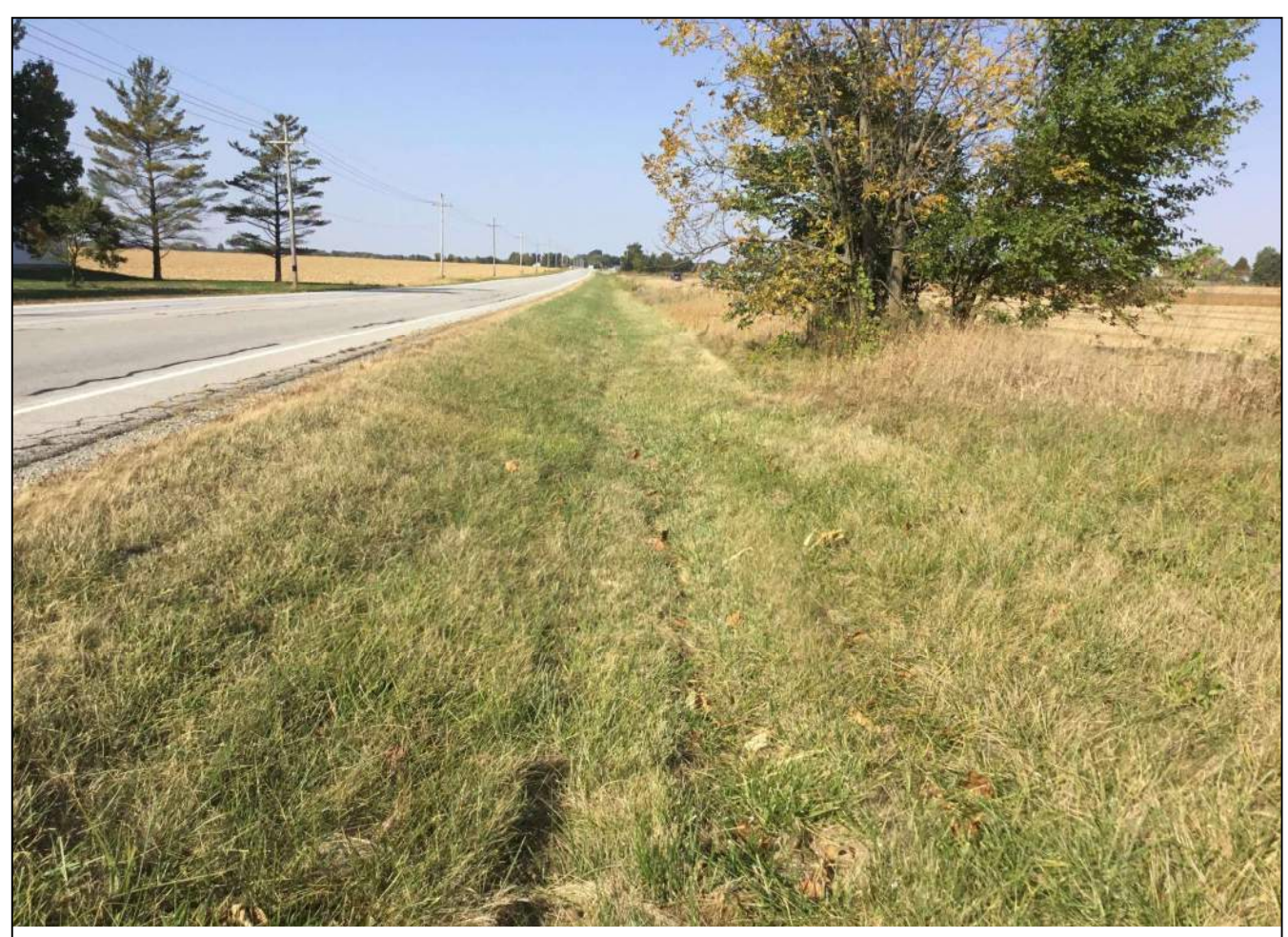
47. Looking west at the surrounding landscape along the north side of SR 32 (WB lane). Photo taken October 7, 2020.