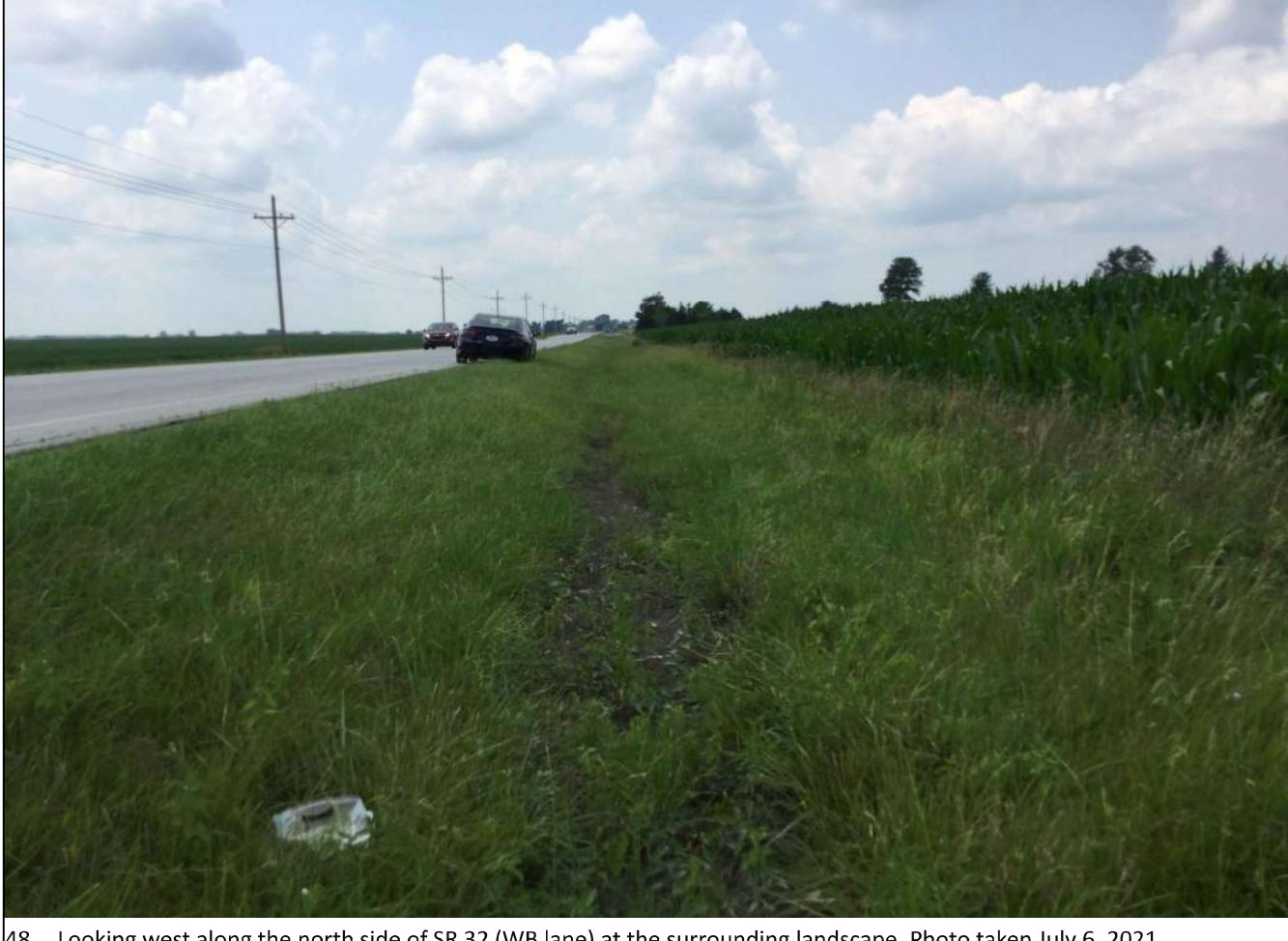
48. Looking west along the north side of SR 32 (WB lane) at the surrounding landscape. Photo taken July 6, 2021.