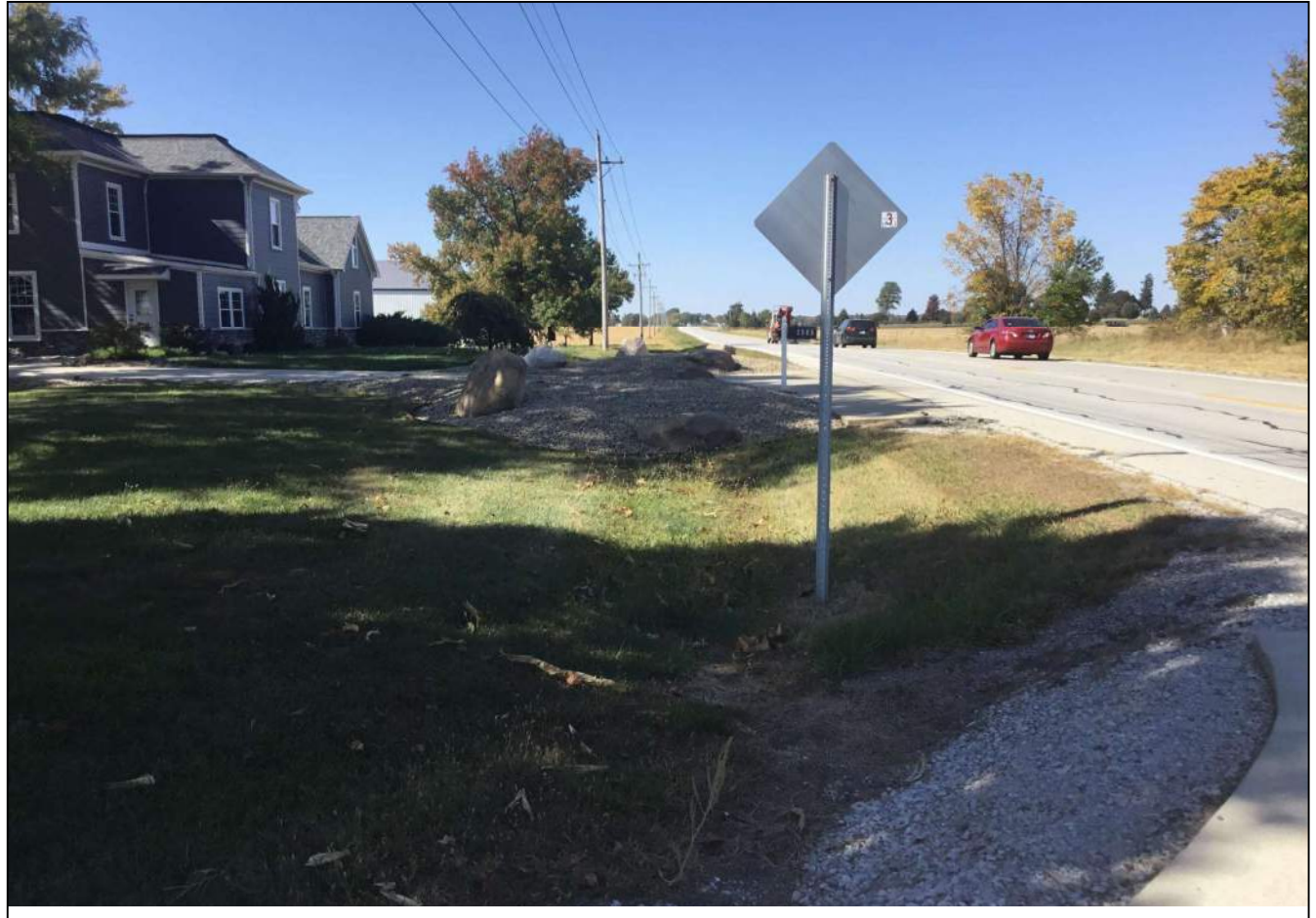
Looking west along south side of SR 32 (EB lane) from a shared residential/agricultural drive. Photo taken October 8, 2020.

Lead Des No. 1800060 Appendix B: Graphics B76 of 210