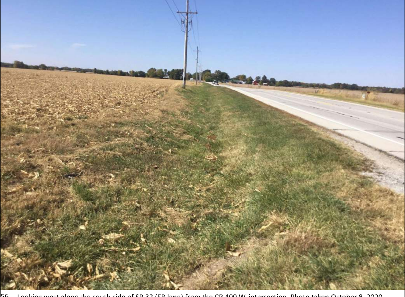
56. Looking west along the south side of SR 32 (EB lane) from the CR 400 W. intersection. Photo taken October 8, 2020.