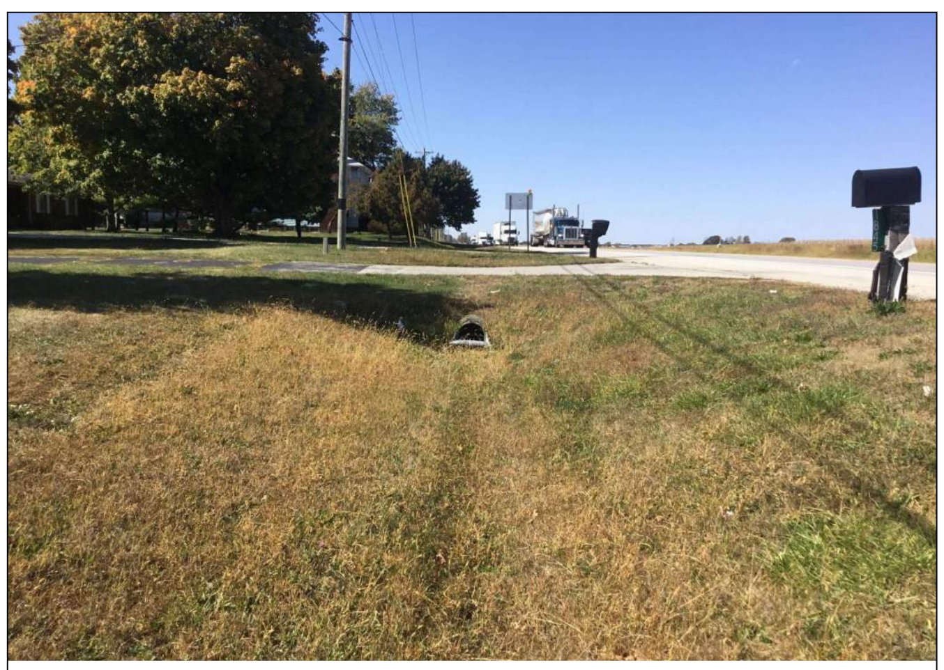
Looking west at the surrounding landscape along the south side of SR 32 (EB lane) of SR 32. Photo taken October 8, 2020.