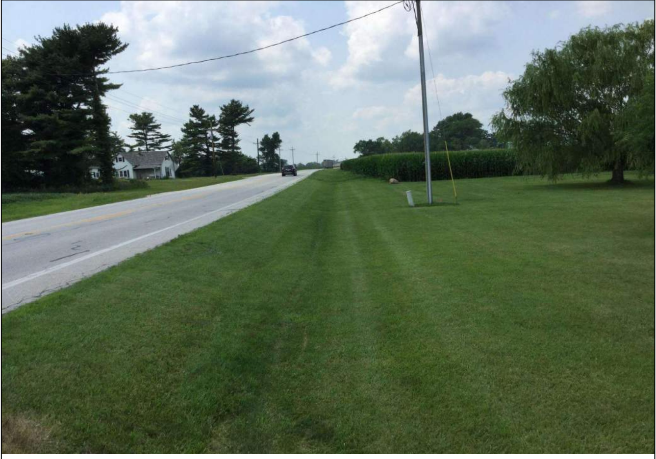
64. Looking west along the north side of SR 32 (WB lane) at the surrounding landscape. This also denotes the end of the first WB passing lane. Photo taken July 6, 2021.

Lead Des No. 1800060 Appendix B: Graphics B85 of 210