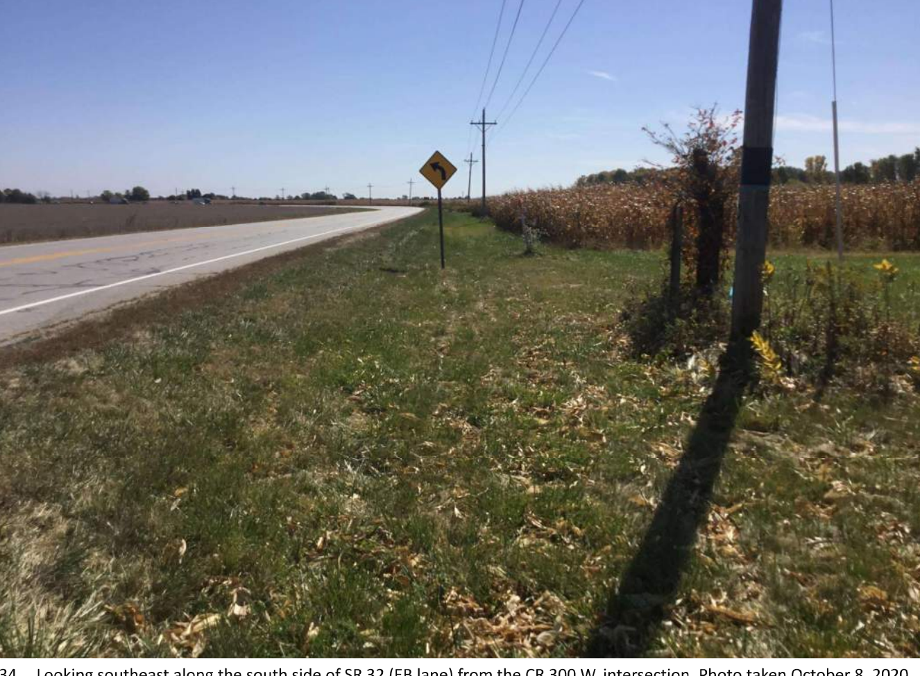
34. Looking southeast along the south side of SR 32 (EB lane) from the CR 300 W. intersection. Photo taken October 8, 2020.