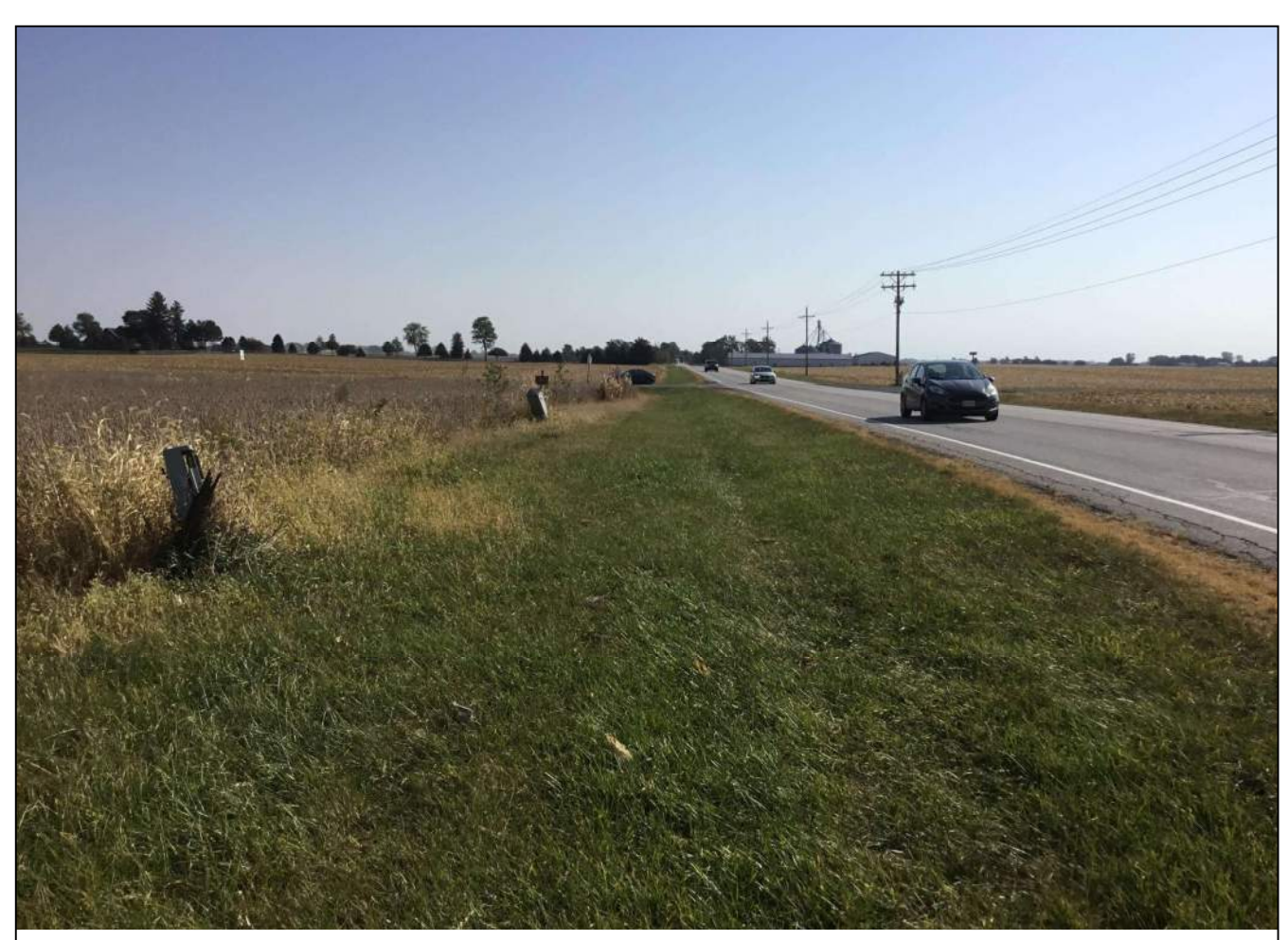
57. Looking east along the north side of SR 32 (WB lane) at the surrounding landscape. Photo taken October 7, 2020.