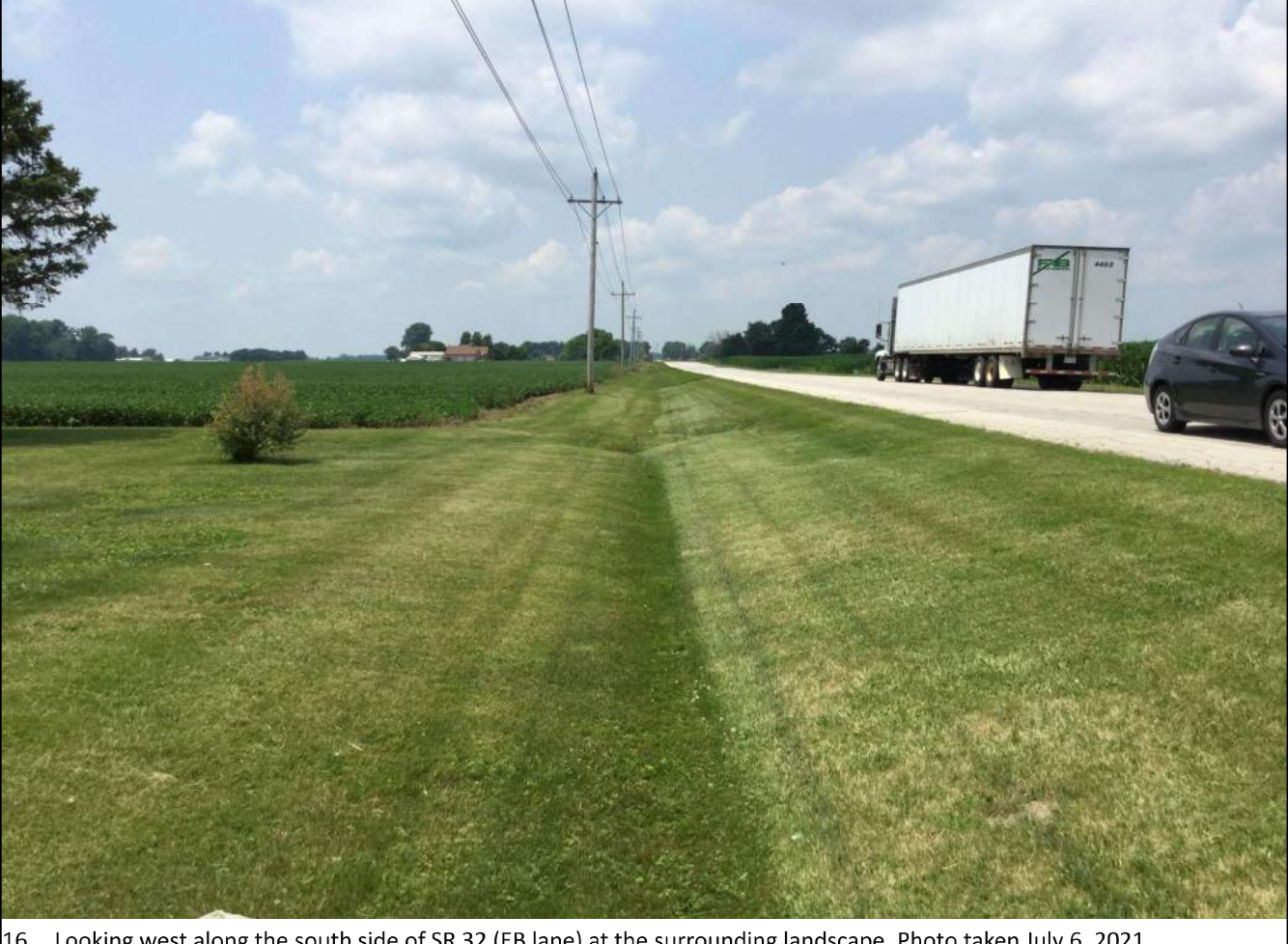
16. Looking west along the south side of SR 32 (EB lane) at the surrounding landscape. Photo taken July 6, 2021.