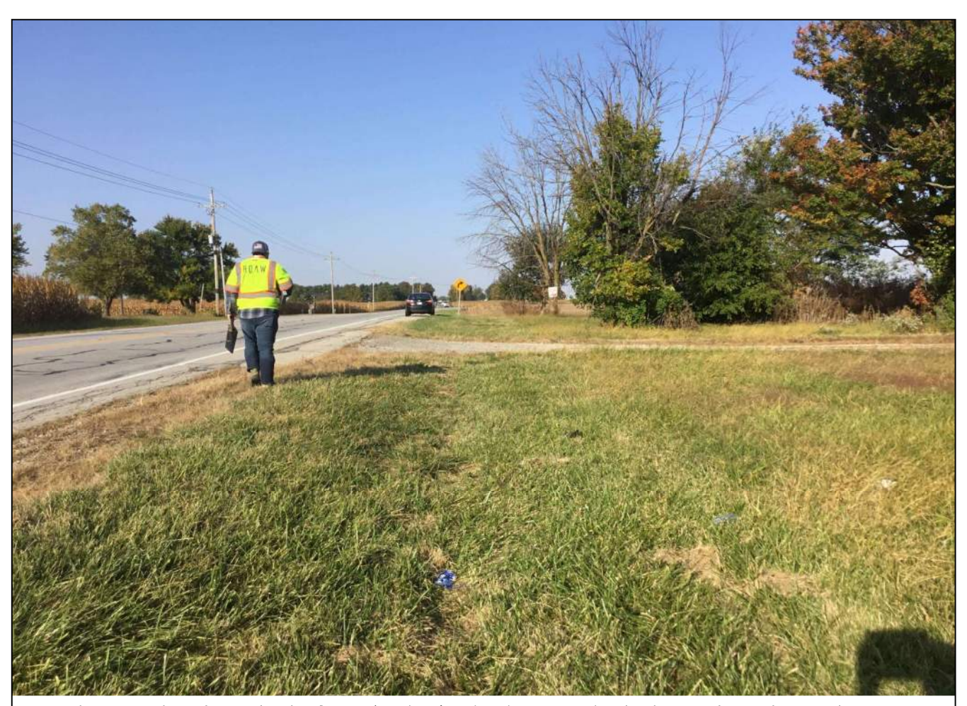
21. Looking west along the north side of SR 32 (WB lane) and at the surrounding landscape. Photo taken October 7, 2020.