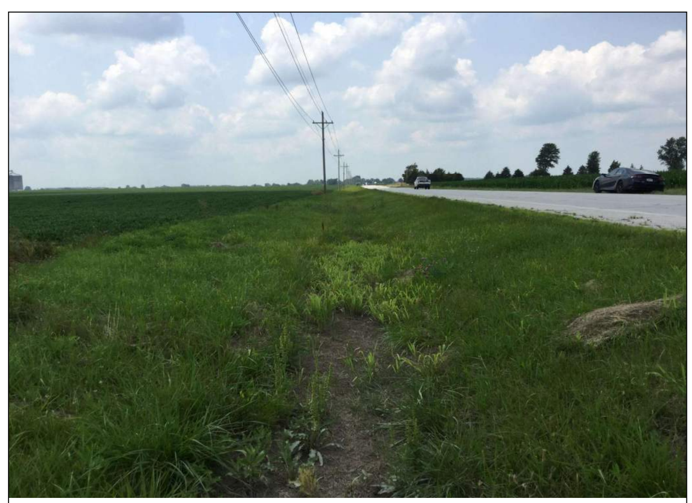
49. Looking west along the south side of SR 32 (EB lane) at the surrounding landscape. Photo taken July 6, 2021.