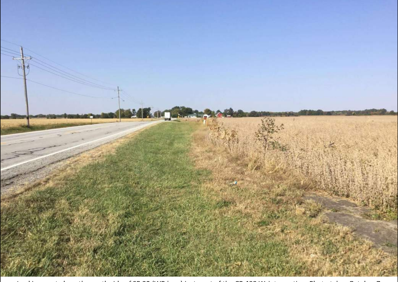
Looking west along the north side of SR 32 (WB lane) just west of the CR 400 W. intersection. Photo taken October 7, 2020.