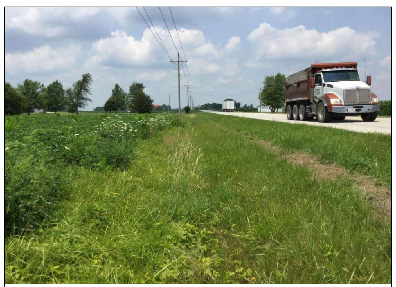
31. Looking northwest along the south side of SR 32 (EB lane) at the surrounding landscape. Photo taken July 6, 2021.