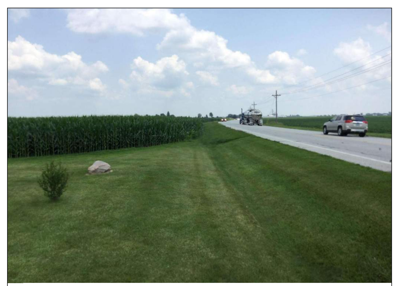
63. Looking east along the north side of SR 32 (WB lane) at the surrounding landscape. Photo taken July 6, 2021.