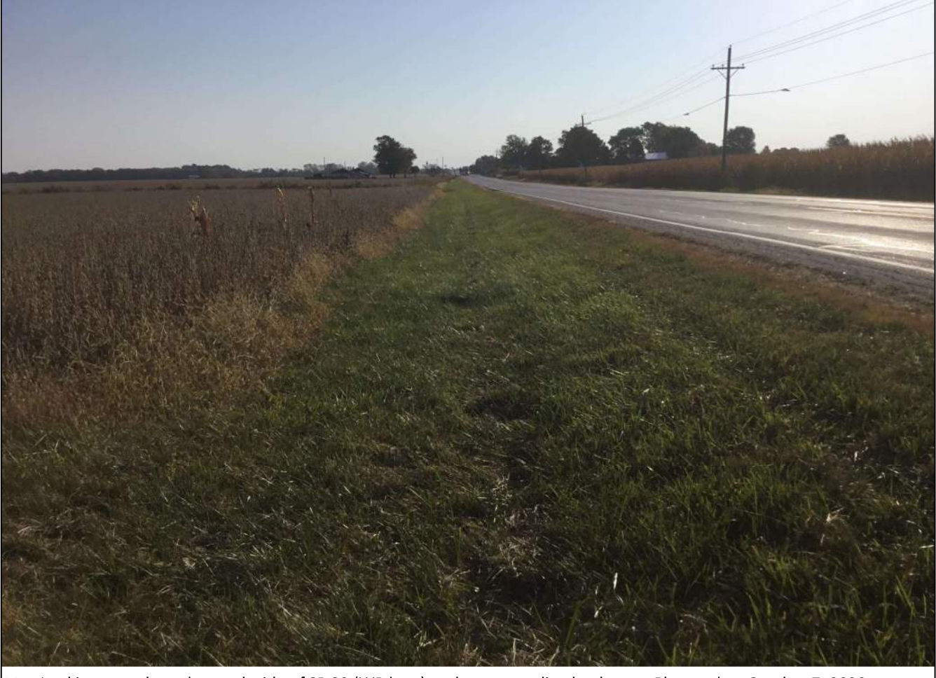
20. Looking east along the north side of SR 32 (WB lane) at the surrounding landscape. Photo taken October 7, 2020.