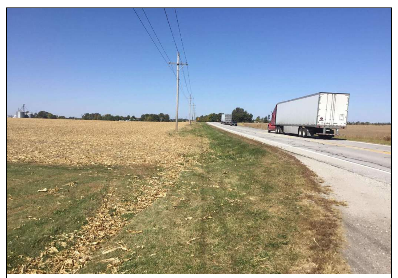
Looking northwest along the south side of SR 32 (EB lane) from the CR 300 W. intersection. Photo taken October 8, 35. 2020.