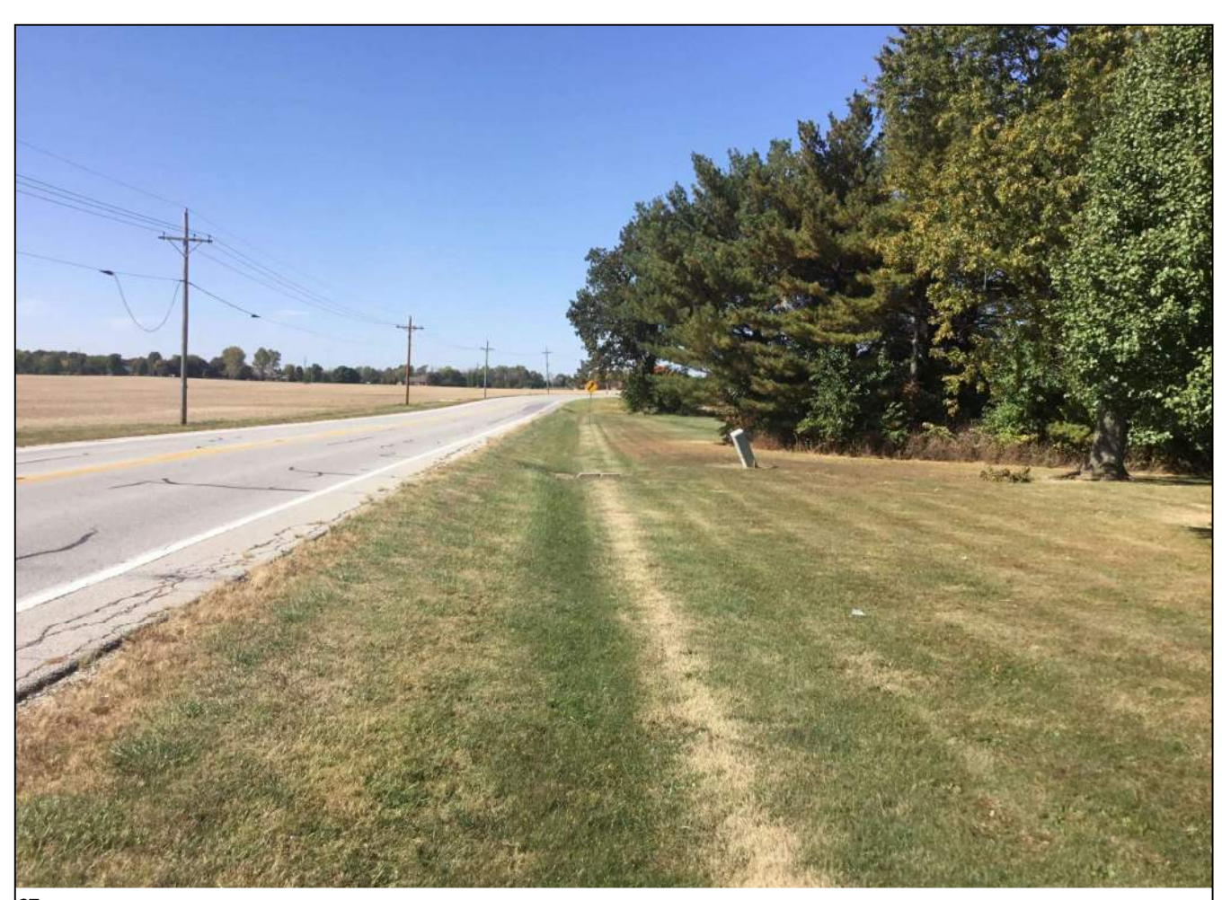
67. Looking west along the north side of SR 32 (WB lane) at the surrounding landscape. Photo taken October 7, 2020.