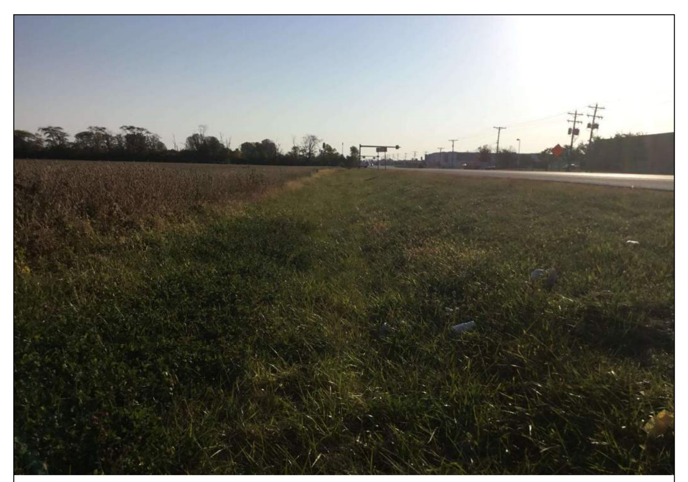
5. Looking east at the surrounding landscape along the north side of SR 32 (WB lane) of SR 32. Photo taken October 7, 2020.