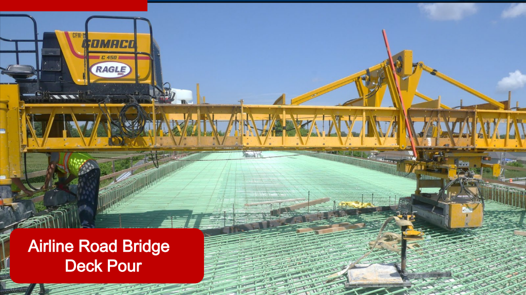
Airline Road Bridge Deck Pour