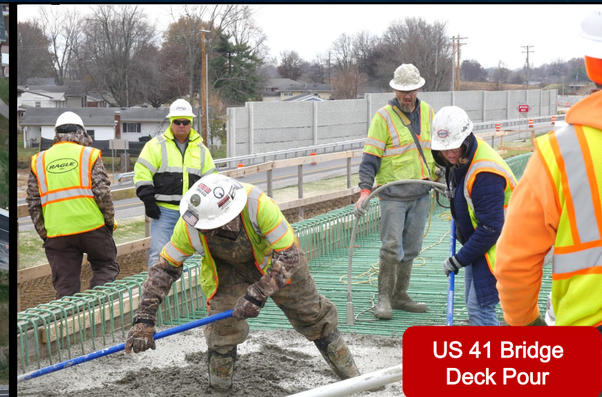
US 41 Bridge Deck Pour