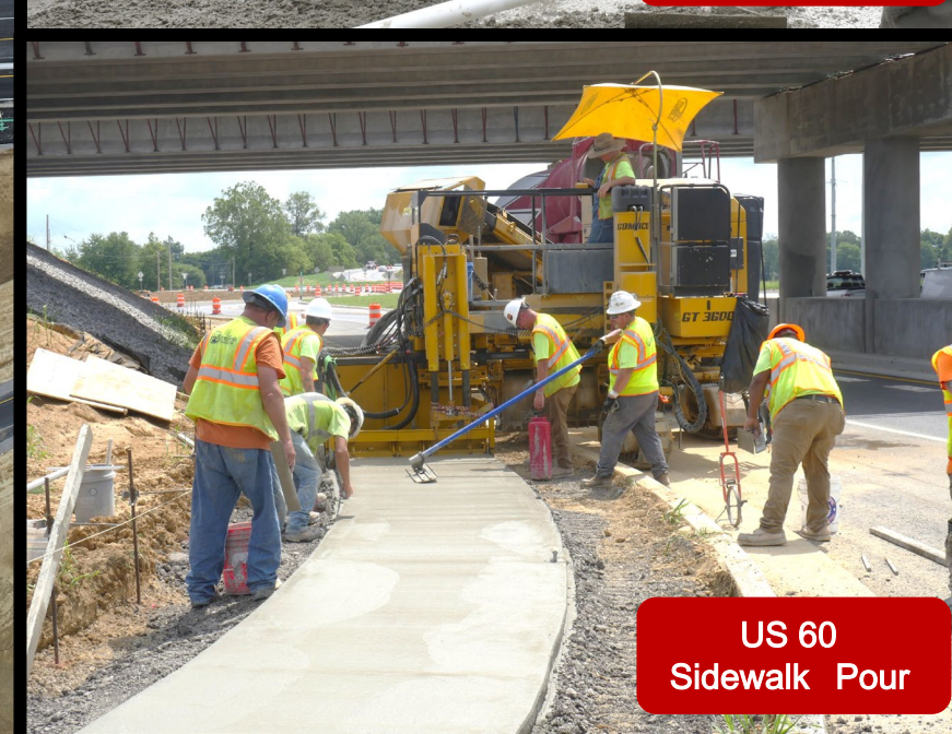
US 60 Sidewalk Pour