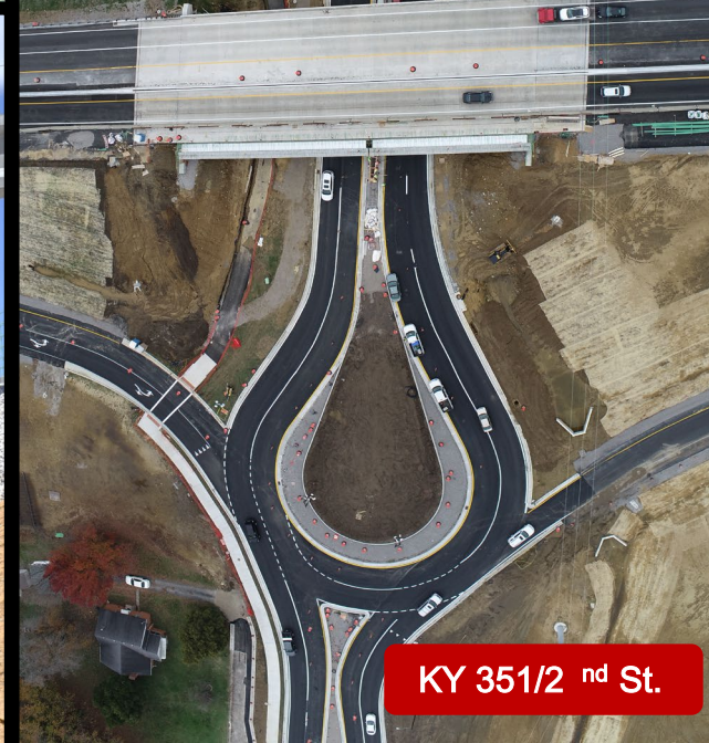
KY 351/2 nd St.