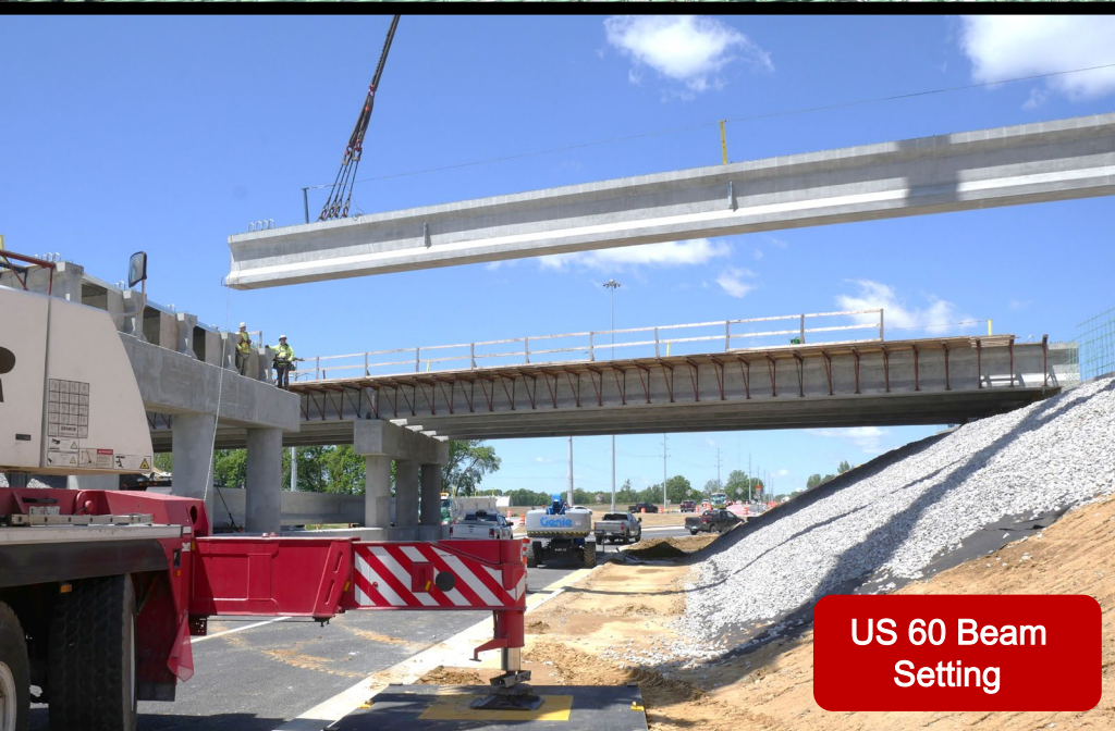
US 60 Beam Setting