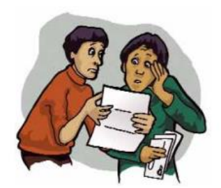
Read Mail & Notices