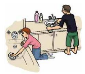
Keep Things Clean