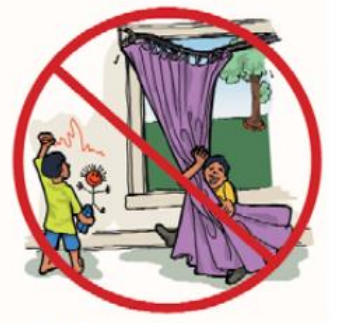
Take Care of Property