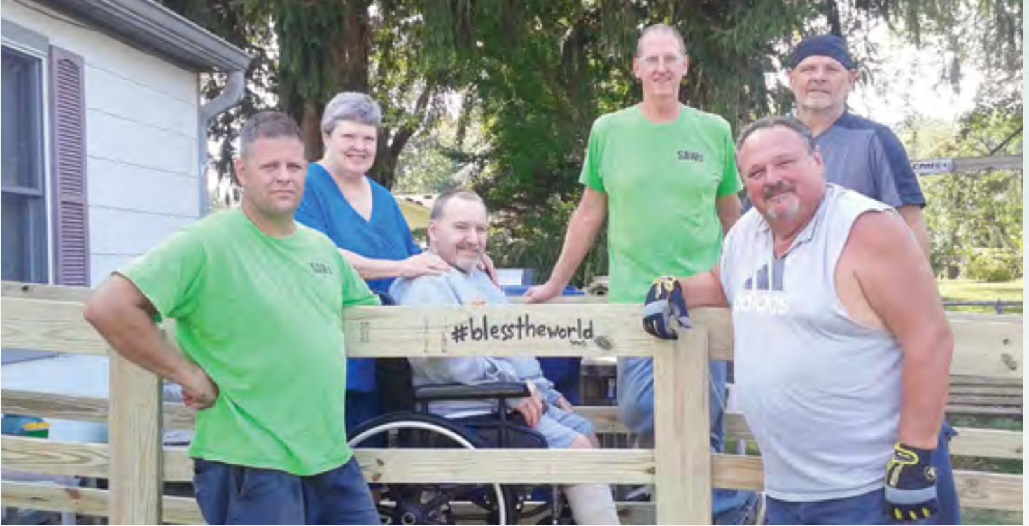
A homeowner is pictured with the crew that installed the ramp outside his Fortville, Indiana home.