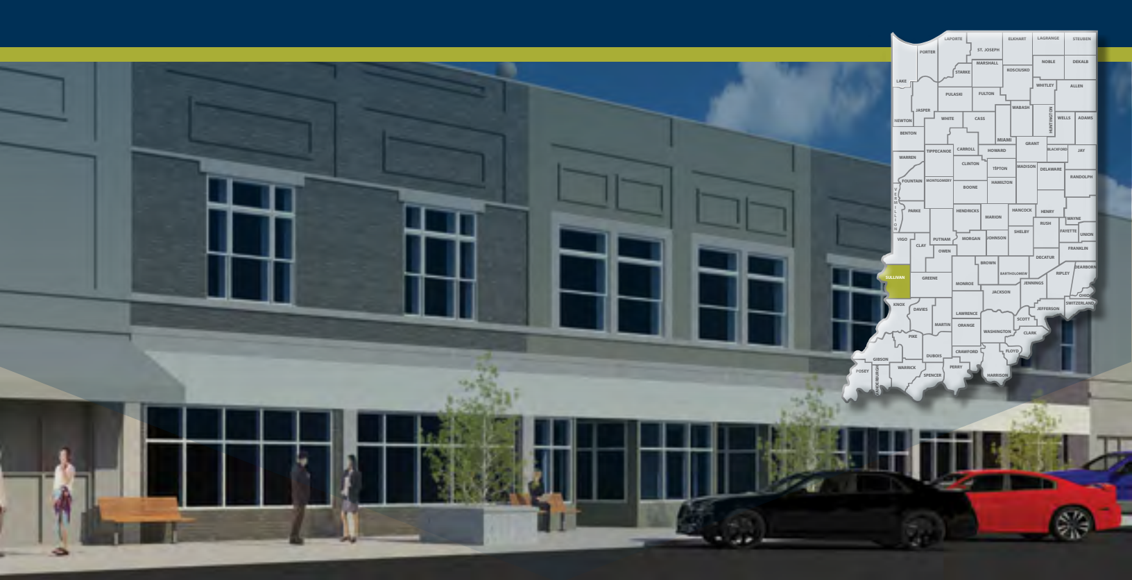
South side of Sullivan City Square rendering