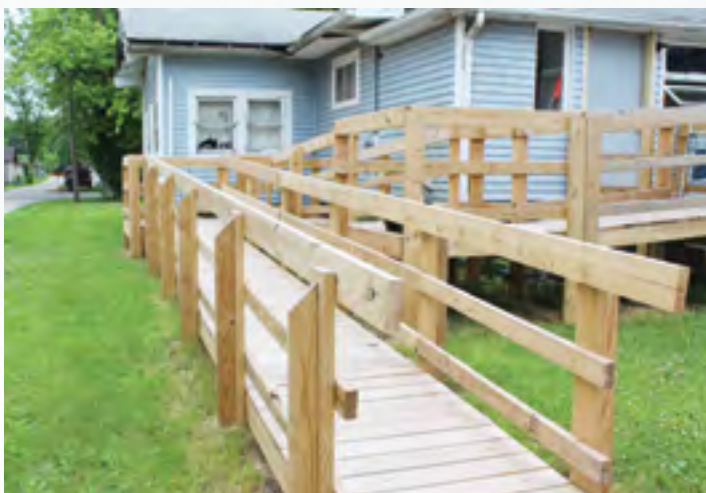
The longest ramp ICAP installed is over 40 feet long. Regulations require one foot of ramp per 1" of incline.

Eligible applicants for the state's Ramp Up Program are non-profit 501(c)3 or (c)4 that can demonstrate an established organizational mission/focus of serving the housing needs of persons with disabilities. More information about the program and eligibility requirements may be found here: www.in.gov/ihcda/rampupindiana.htm 🏠