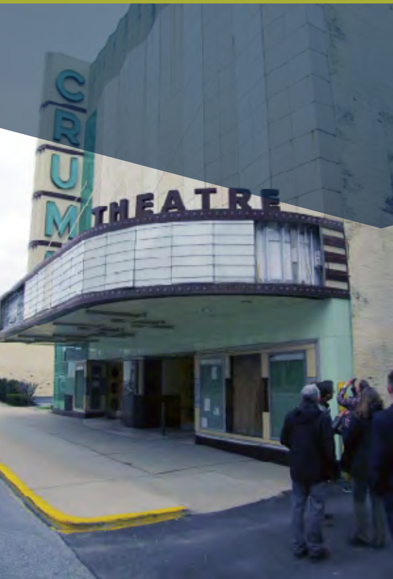
Exterior of the Crump Theater building and its Art Deco façade.