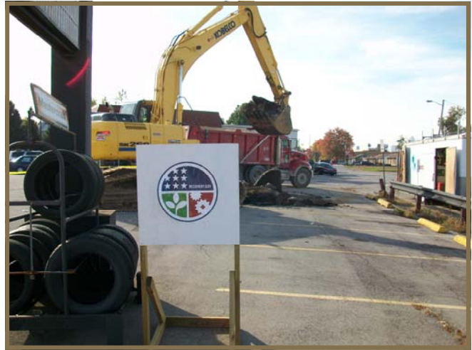
ARRA sign posted on-site, with excavation underway.