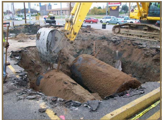
USTs before removal.