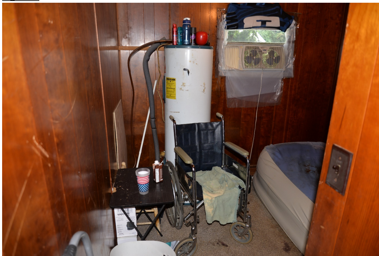
Figure 5 : Aaron's small room is filled by his mattress, wheelchair, tray table, and a water heater.