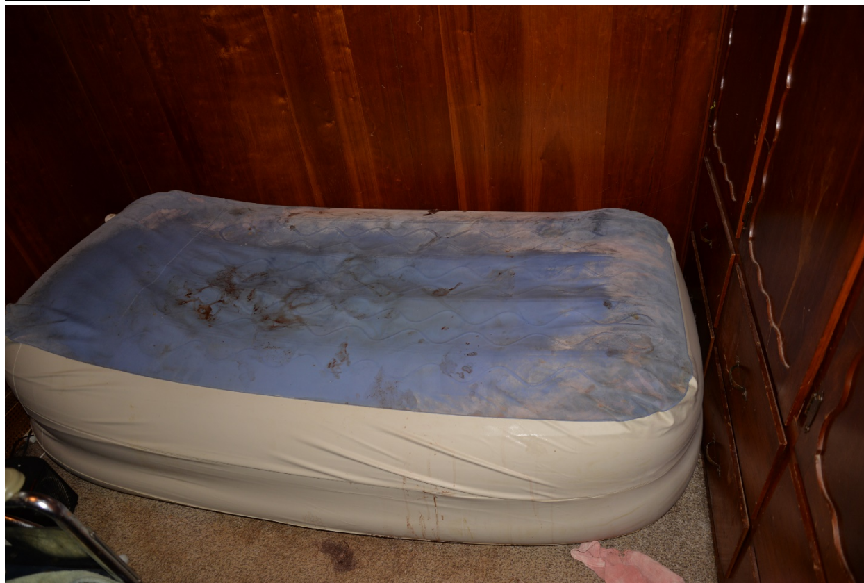
Figure 6 : Aaron's blood-stained mattress fills more than half of his bedroom.

Harvey initially reported that he had been giving Aaron nutritional supplement drinks after he began refusing food, but later admitted to police that the drinks were purchased the night before Aaron was hospitalized. Additionally, Harvey claimed to have been treating Aaron's pressure sores when they developed in July 2019. However, in a police interview Harvey's husband stated that the antibiotic and bandages for Aaron's pressure sores were purchased just days before Aaron was hospitalized.