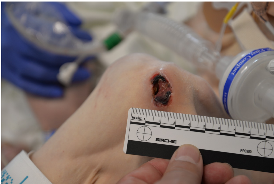
Figure 3: Hospital staff measures the pressure sore on Aaron's knee.