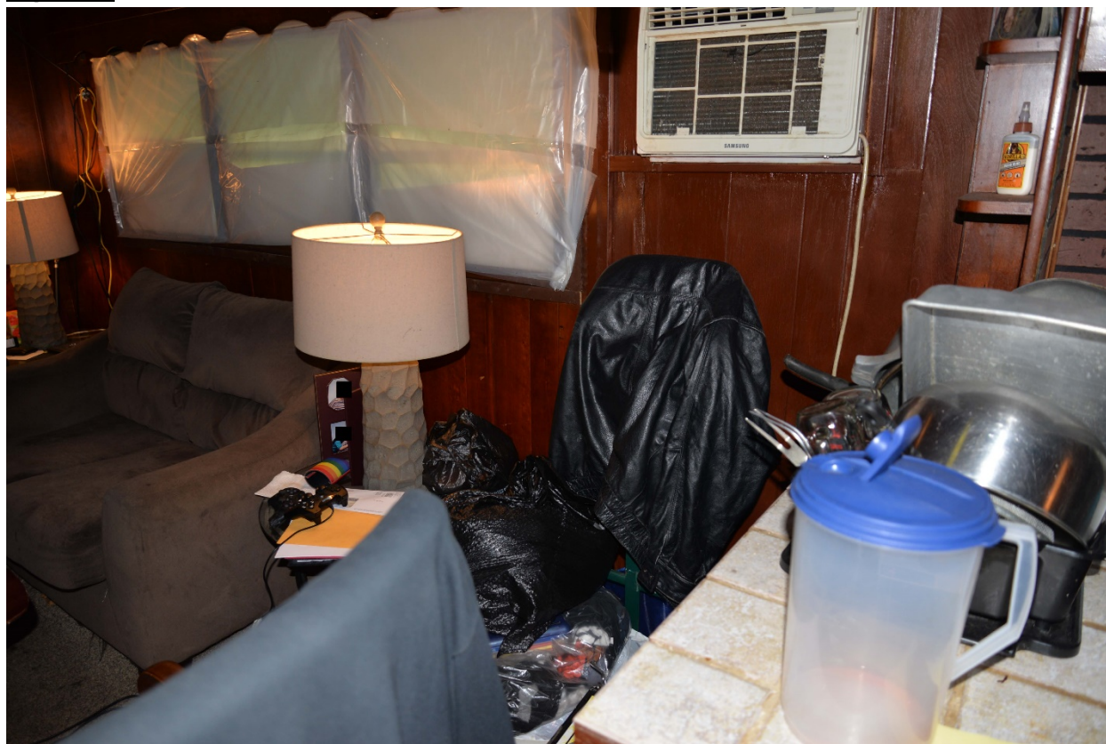
Figure 4 : Aaron's dark and crowded living room would have been difficult to navigate in his wheelchair.