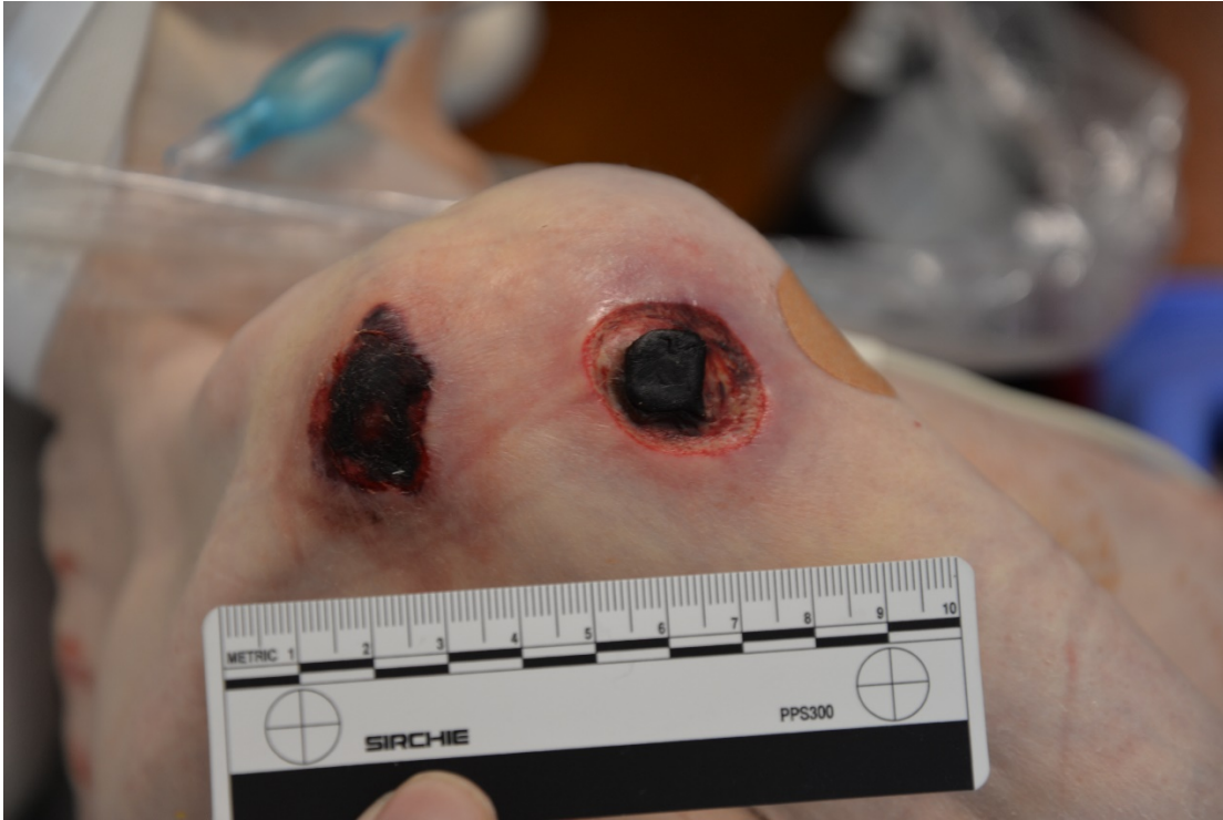
Figure 2: Two severe pressure sores on Aaron's shoulder.