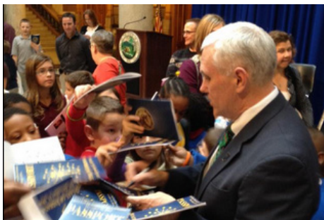
Governor Mike Pence signing programs and talking to fourth-graders about Indiana.