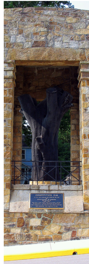
Constitution Elm today.