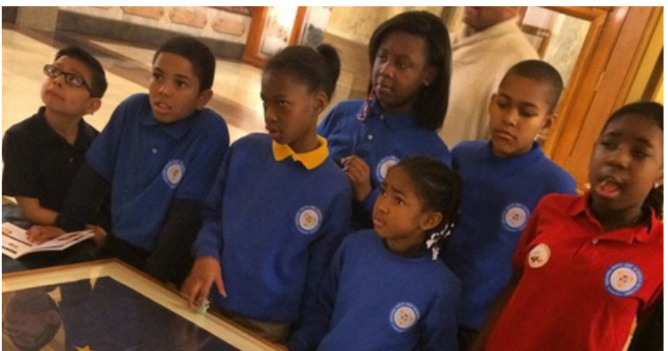
Students from Indiana Math and Science Academy view the original state banner.

Governor Pence also announced a "signature event" for the state's bicentennial. The Indiana