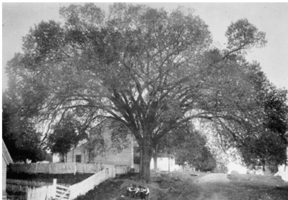
A picture of the Constitution Elm in Corydon, Indiana.