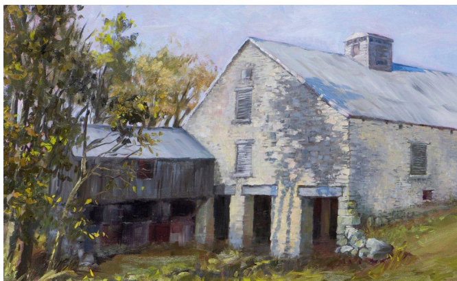
Photo courtesy of artist Gwen Gutwein. This is the Lloyd-Field barn of Jefferson County.

The majority of Gwen Gutwein's paintings for the project are created on location, using the technique called plein air painting. The wonderful barn owners also compile fascinating family and barn histories. This information is compiled into a story which will be exhibited with the completed artwork.