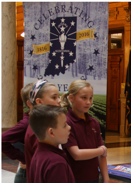
Fourth-grade students learning about the bicentennial celebrations.

To watch a webcast of Statehood Day events, go to http://webinar.isl.in.gov/p38915bo3g5/ .