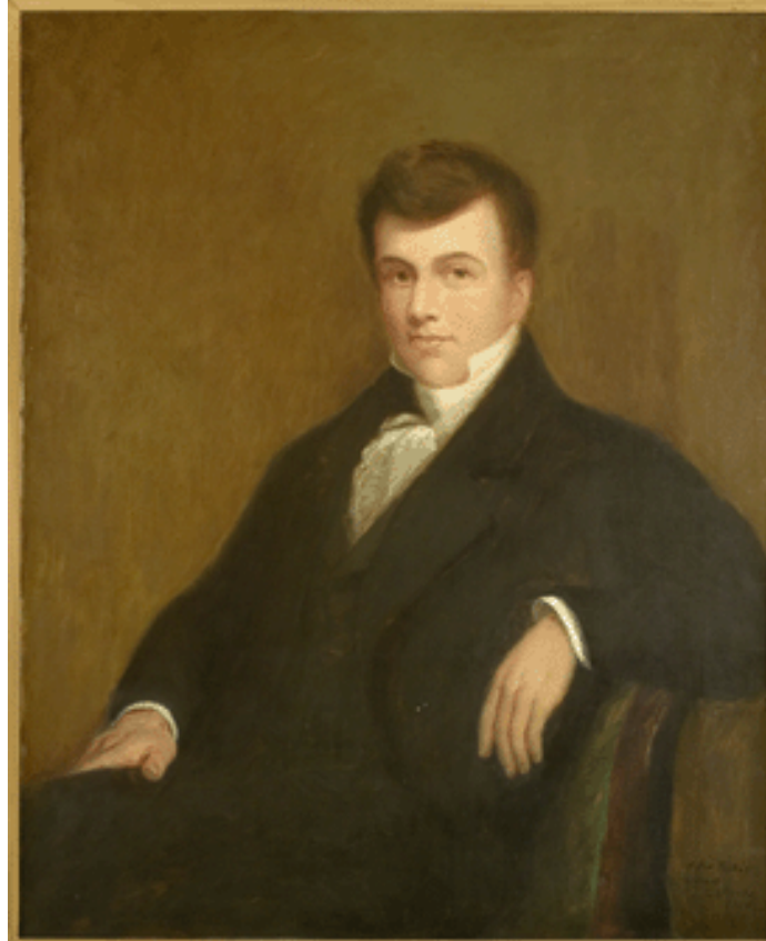
A portrait of Jonathon Jennings, the first governor of Indiana.

Jonathan Jennings served as president of the 1816 Constitutional Convention called to frame a constitution for the new state of Indiana. This is an image of Jennings’ signature page from the original (1816) Constitution of the State of Indiana (pictured left). Jennings was elected as Indiana’s first state governor in 1816.