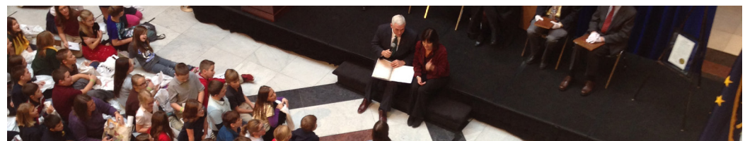
Governor Mike Pence and First Lady Karen Pence reading to the fourth-grade students at Statehood Day.