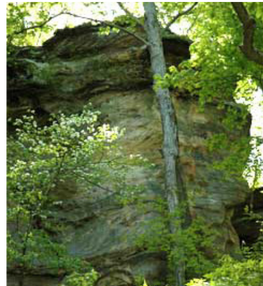
The Pinnacle is a perpendicular descent of over two hundred feet of sandstone.

“Martin County is a portal to the Indiana past, with great forests, vistas, rolling hills, rivers, and ancient rocks existing today, as they would have been seen by those who came before. The people of Martin County treasure and preserve those natural wonders with their wildlife habitats. They have also established carefully in their midst, modern industries and agriculture. These are monuments to human endeavor and harbingers of the future.”