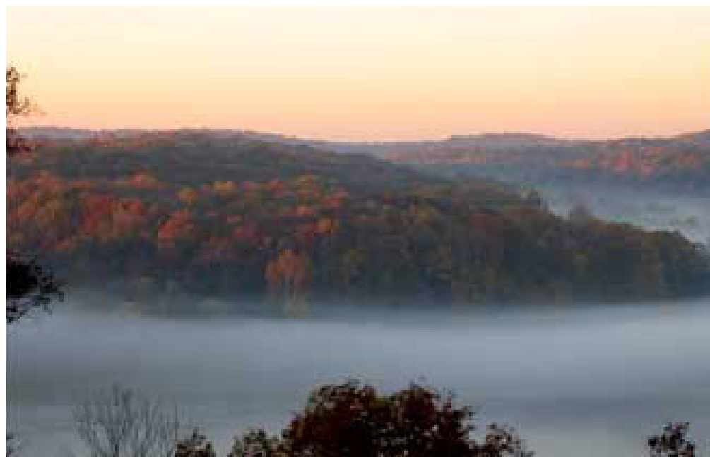
A scenic view of the winding White River through river bottom, farms and valleys.

This natural geological rock formation in Martin County, Jug Rock, is composed of sandstone and is located in Shoals near the east fork of the White River. As the largest free-standing table rock formation (also called a “tea table”) in the United States east of the Mississippi River, the Jug Rock has created a great deal of interest in geological circles. Jug Rock stands alone with no adjacent ledge, which classifies it as one of the most puzzling formations, known as “Stand Rocks,” in the United States.