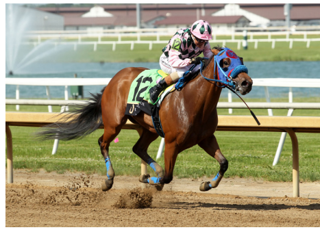
Spirited Justice (Lantana Mob - She Fox) Breeder: Justice Farm Stallion Owner: Justice Farm

Spirited Justice secured her fourth win after winning the Swifty Sired Fillies handicap, bringing her total career earnings up to $198,006! The three-year-old filly finished in 1:04.29, the second fastest time recorded for the Handicap.