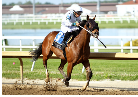
Hawkeye (Storm's Eye - Indian Run) Breeder: Triple D Partners Stallion Owner: Barefoot Farms

Hawkeye won his first premier race in the 23rd running of the William Henry Harrison. This was his 6th career win in 16 starts and increased his career earnings to $214,115.