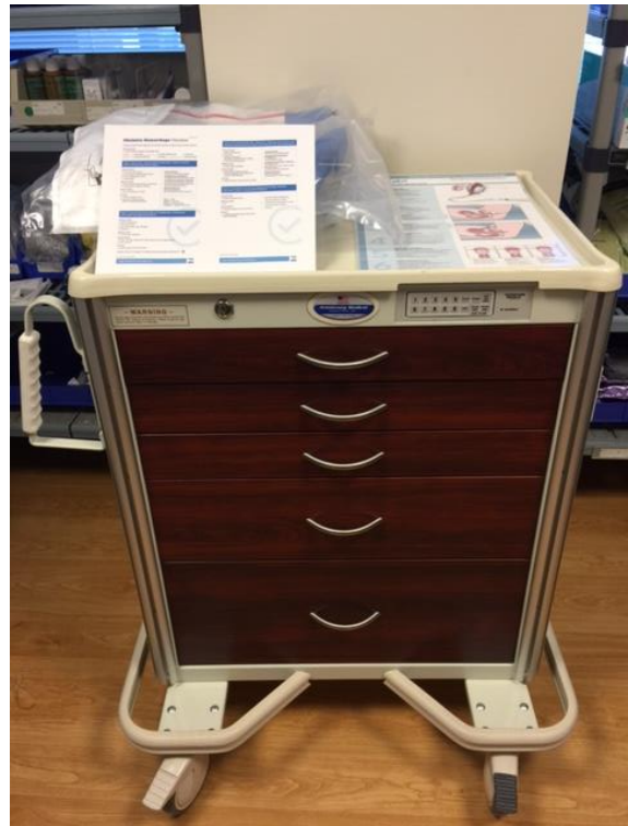
Hancock Regional Hospital