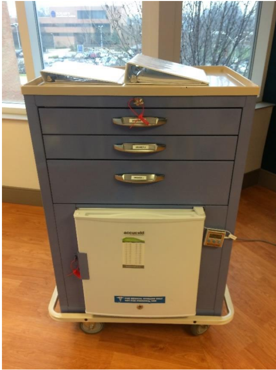
St. Vincent Evansville