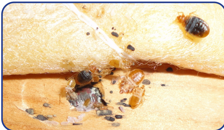
Adult bedbug (left), All life stages present (right).