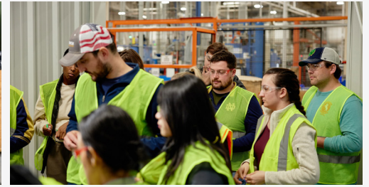
Over 100 Notre Dame MBA students tour Southwire facility and engage in Q&A with company leadership

coordinated through South Bend - Elkhart Regional Partnership