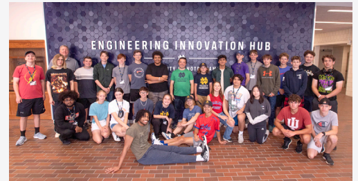
Engineering Innovation Hub, University of Notre Dame Students attend the first Engineering Summer Camp hosted by the Notre Dame College of Engineering.

RATIO OF LIFT DOLLARS TO NEW DIRECT INVESTMENTS IN REGION as a result of LIFT activities