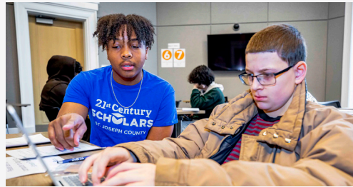
Community Learning Center, St. Joe County Public Library Students attend the 21st Century Scholars Success Fest at the St. Joe County Public Library.