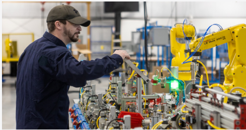
Larry & Judy Garatoni Center for Advanced Manufacturing and Automation (iFlex Lab), Ivy Tech South Bend-Elkhart