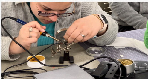
Saint Mary's College Student participates in applied learning course.

engaged with local companies through internships and applied learning courses, including 320 Notre Dame students