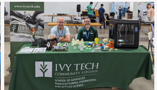
Representatives from Ivy Tech's School of Advanced Manufacturing, Engineering, and Applied Science attend a STEM resource fair.