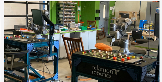
Elkhart Area Career Center (EACC), Elkhart Community Schools Collaborative Robots (Cobots) used by students in the Automation & Engineering Technology program