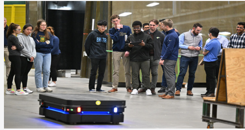
Notre Dame students and enFocus Industry Innovation Fellows test a robot at the Lippert Glass plant as part of an EG35101: Industry and Community-Based Innovation Projects course.