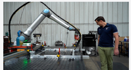
iNDustry Labs Engineer in Residence demonstrating automated welding on the cobot recently installed at LIFTCO for the Manufacturing Readiness Accelerator.

sourced from South Bend-Elkhart regional companies from 2019 to 2024