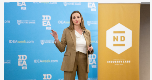
President and CEO of Kamgrounds of America, Inc., (KOA) speaks at the IDEA Week Industry Innovation Forum.