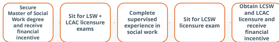
Behavioral Health Pathway

CBH governs the Academy on an ongoing basis using a combination of a program coordinator, a steering committee, and a working group. These stakeholder groups will meet with a regular cadence to ensure the smooth implementation and continued sustainability of the Academy.